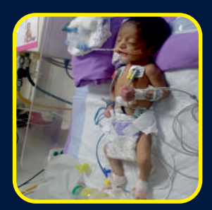
Baby of Swetha (1 month) Septic Shock