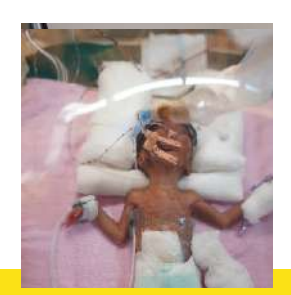
Baby of Manju 1 day Premature Birth Complications