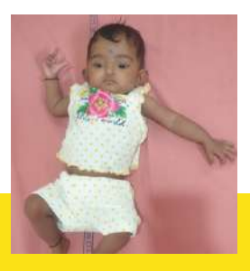
Anvika 8 months Heart Disease