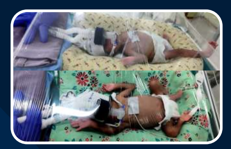
Twins of Preeja 27 Days Premature Birth Complications