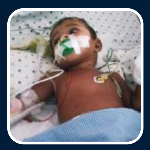
Sumayya 1 Year Hischsprung Disease