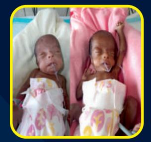
Twins of Vihina (2 months) Extreme Prematurity