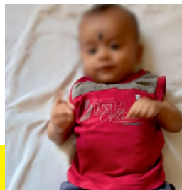
Bhavish Punith Babu 5 Months Neuroblastoma Stage III.