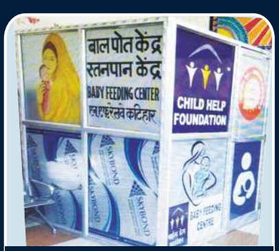
Katihar Railway Station Bihar