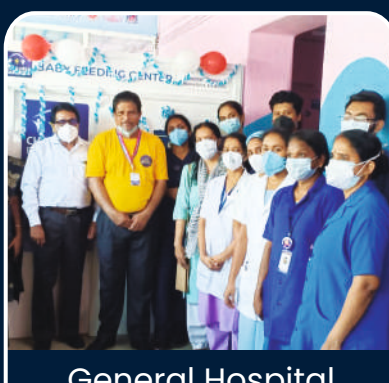
General Hospital Kerala