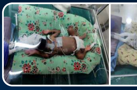
Twins of Preeja 27 Days Premature Birth Complications