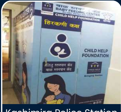
Kashimira Police Station Maharashtra