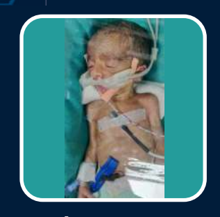
B/o Sandhya Infant Premature Birth Complications