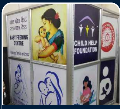
New Jalpaiguri Railway Station West Bengal