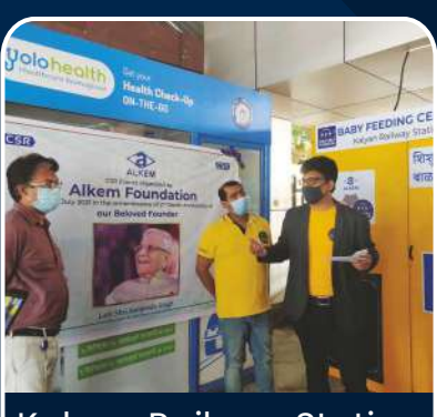
Kalyan Railway Station Maharashtra