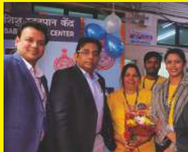
Civil Hospital Sector 10 Gurugram, Haryana