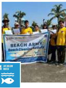
14 LIFE BELOW WATER