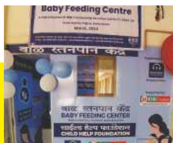
Palghar Rural Hospital Maharashtra