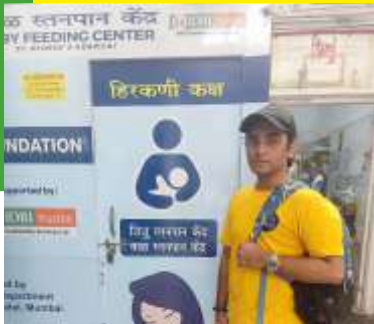
St. George's Hospital Maharashtra