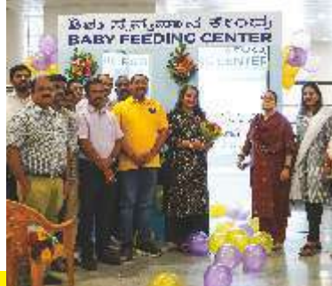
Majestic Metro Station Karnataka