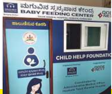
Taluk General Hospital Hoskote, Karnataka