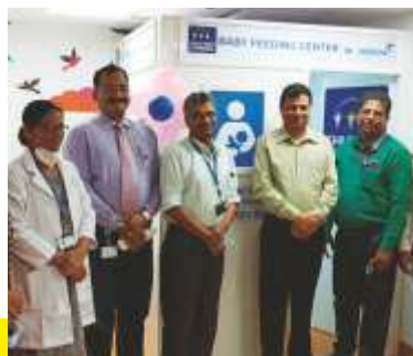
Lakeshore Hospital Kochi, Kerala