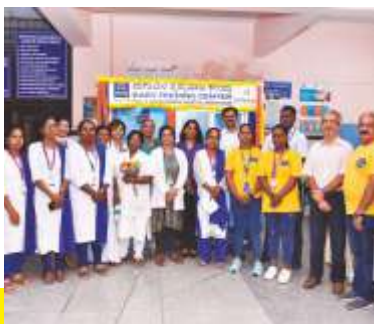
C. V Raman Hospital Karnataka