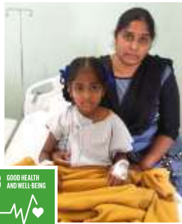
3 GOOD HEALTH AND WELL-BEING