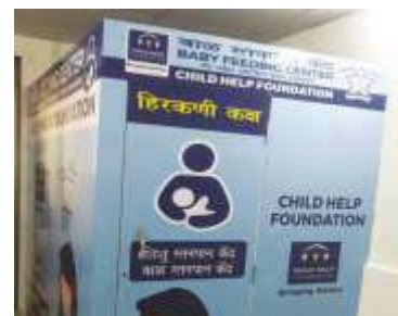
Kashimira Police Station Maharashtra