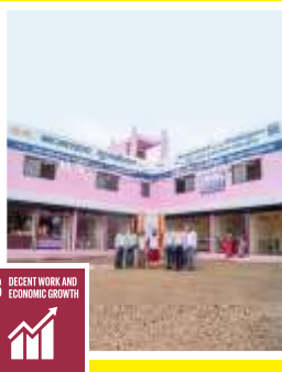
8 DECENT WORK AND ECONOMIC GROWTH