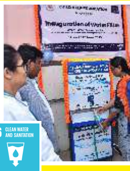
6 CLEAN WATER AND SANITATION