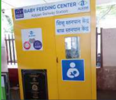
Kalyan Railway Station Maharashtra