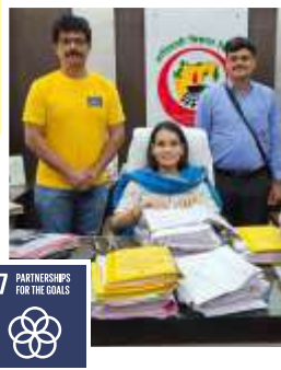
17 PARTNERSHIPS FOR THE GOALS