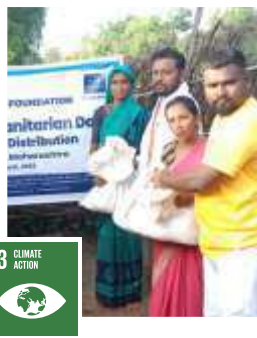
13 CLIMATE ACTION