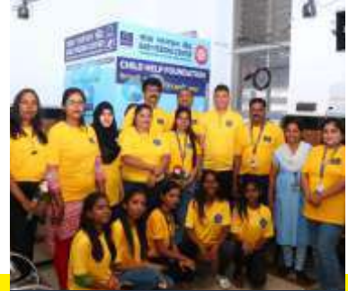
Pune Railway Station Maharashtra