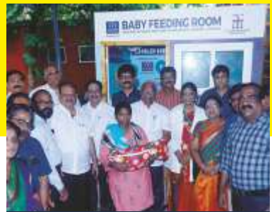
Institute of Obstetrics and Gynaecology Egmore Chennai, Tamil Nadu