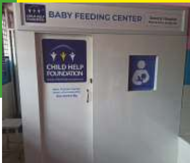
General Hospital Ernakulam, Kerala