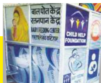
Katihar Railway Station Bihar