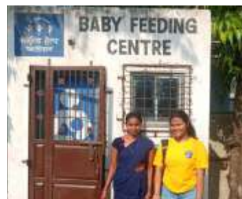
Palghar Railway Station Maharashtra

West Bengal and Bihar: The BFCs at New Jalpaiguri Railway Station in West Bengal and Katihar Railway Station in Bihar need additional maintenance and more volunteers.