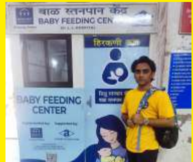
Sir J.J. Hospital Maharashtra