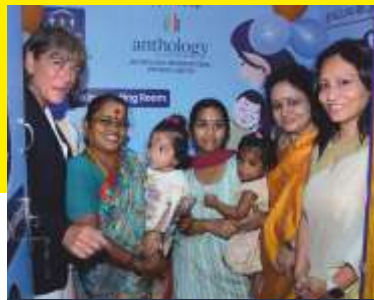
Institute of Child Health and Hospital for Children Egmore, Chennai, Tamil Nadu