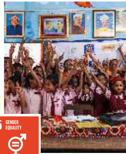
5 GENDER EQUALITY