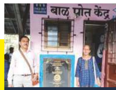
Boisar Railway Station Maharashtra