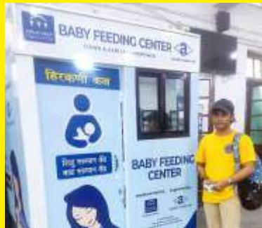
Cama and Alless Hospitals Maharashtra