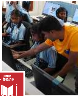
4 QUALITY EDUCATION