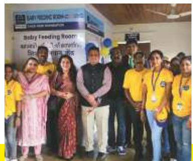
Shornur Railway Station Kerala