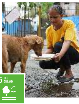
15 LIFE ON LAND