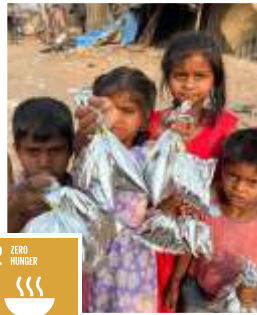
2 ZERO HUNGER