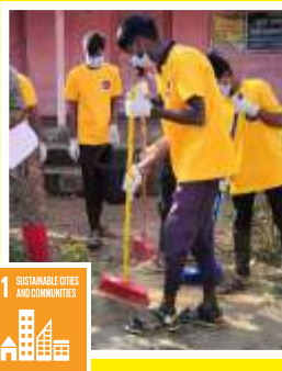
11 SUSTAINABLE CITIES AND COMMUNITIES