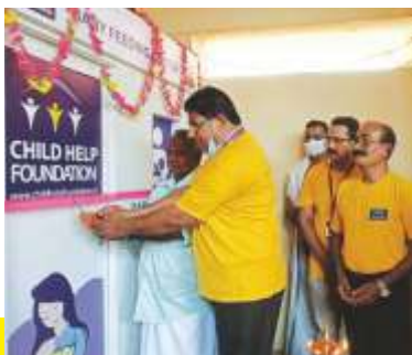
Chottanikkara Temple Kerala