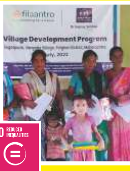
10 REDUCED INEQUALITIES