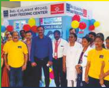
Sir Atal Bihari Vajpayee Medical College and Institute Bengaluru, Karnataka