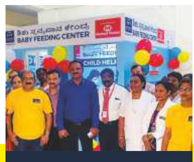
Shri Atal Bihari Vajpayee College Karnataka