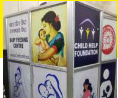
New Jalpaiguri Railway Station West Bengal