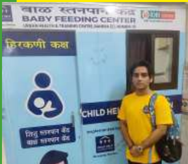
Urban Health Centre Maharashtra