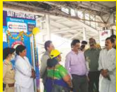
Visakhapatnam Railway Station Andhra Pradesh