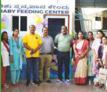
Yeshwantpur Metro Station Karnataka