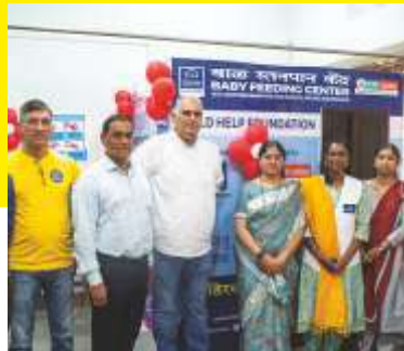
Krantisinh Hospital Satara, Maharashtra