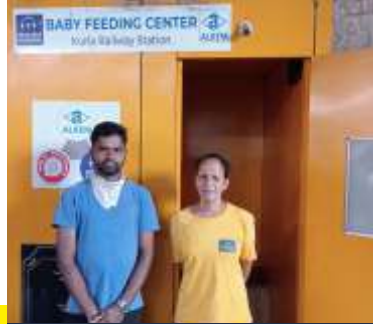
Kurla Railway Station Maharashtra