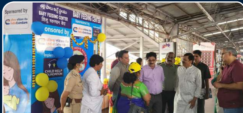
Vizag Rly Station, Andhra Pradesh