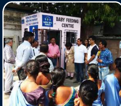
Boisar Railways Station Maharashtra