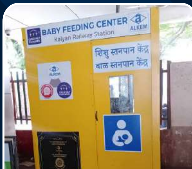
Kalyan Railway Station Maharashtra