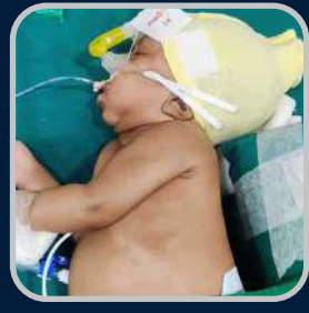
Baby of Manorama 2 Months Neonatal Encephalopathy