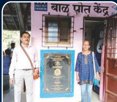
Palghar Railway Station Maharashtra

Child Help Foundation visited Baby Feeding Centres (BFCs) in Pune, Palghar, Boisar, Kalyan, and Kurla Railway Stations and Sir J. J Hospital, Cama And Albles Hospitals, St. George's Hospital, Urban Health Centre Hospital, Kashimira Police Station in Maharashtra, BFCs in Chottanikkara Temple, General Hospital and Lakeshore Hospital, in Kerala, Atal Bihari Vajpayee and C. V Raman Hospital in Bengaluru, Karnataka, BFCs in Katihar Railway Station, Bihar, Vizag Railway Station, Andhra Pradesh and New Jalpaiguri Railway Station, West Bengal and Egmore Medical Hospital, Tamil Nadu, throughout November to take updates. All BFCs were found to be well-maintained and hygienic. A board was placed outside the Baby Feeding Centre in Kashimira Police Station to inform the mothers about its presence, as the centre was not being utilized. A brand new baby feeding centre was inaugurated at the Institute of Obstetrics and Gynaecology in Egmore, Chennai, Tamil Nadu.