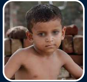
Soban 5 Years Multiple Metastasis and Carcinoma Cystic