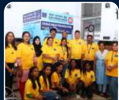
Pune Railways station Maharashtra