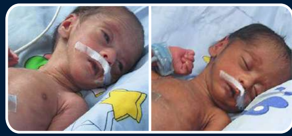
Twins of Jyothi Infants Premature Birth Complications