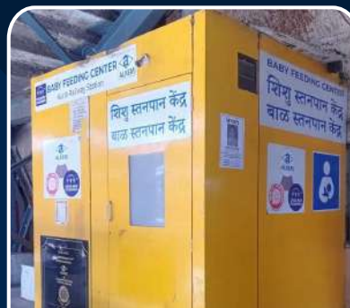
Kurla Railway Station Maharashtra