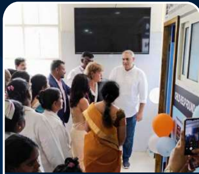
Chennai Tamil Nadu