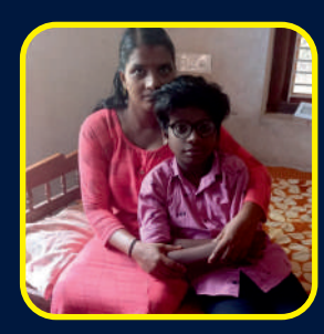
Fidal Dev 12 Years Heart Disease