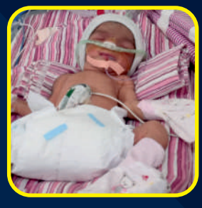
B/O Fauzia 2 Months