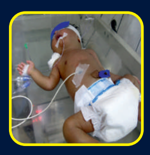
B/O Sabeena Khatun 1 Day Premature Birth Complication