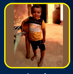
Ayush 2 Years, 6 Months Heart Disease