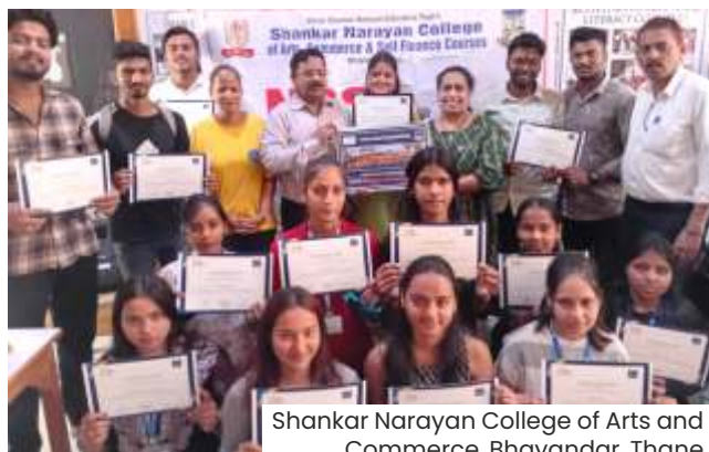
Shankar Narayan College of Arts and Commerce, Bhayandar, Thane

The students were thrilled to receive their certificates and expressed sincere gratitude to Child Help Foundation for recognizing their involvement. Their commitment, enthusiasm, and spirited participation in this prestigious event were truly celebrated.