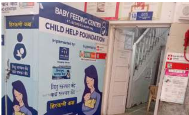
St George Hospital, Mumbai An average of 3 mothers visit daily