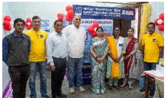
Civil Hospital, Satara Looked after well by hospital staff. An average of 4 mothers use it daily