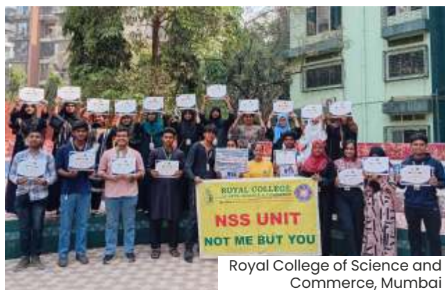
Royal College of Science and Commerce, Mumbai