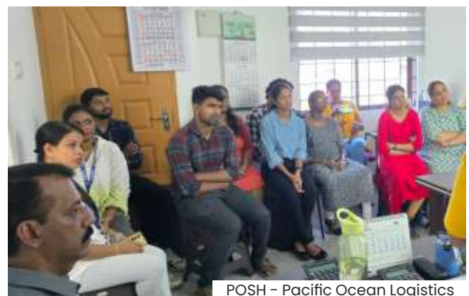
POSH - Pacific Ocean Logistics