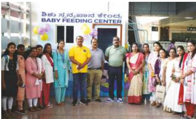
Yashwantpura Metro Station Bengaluru 47 beneficiaries use it per day