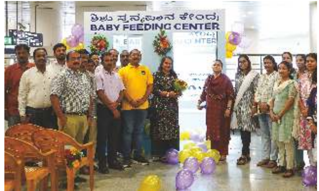
Majestic Metro Railway Station Bengaluru Maintained well, an average of 29 mothers use it daily