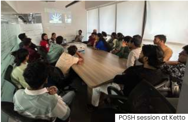
POSH session at Ketto