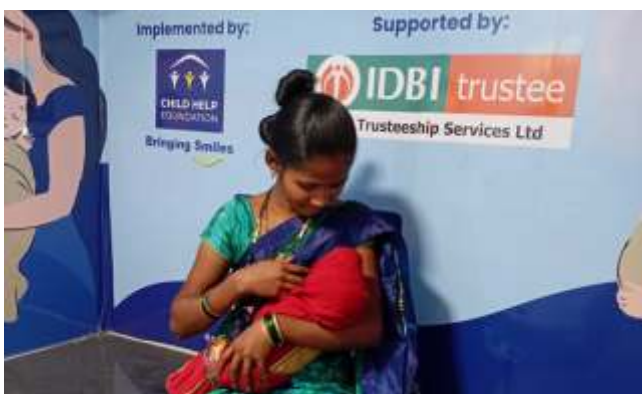
Urban Health Centre, Mumbai Visited interns from Atlas Skill Tech University. The key is with the Station Master