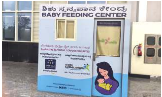
Baiyyappannahalli Metro Station, Bengaluru The centre is used very well. 49 beneficiaries use it per day