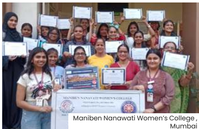
Maniben Nanawati Women's College, Mumbai