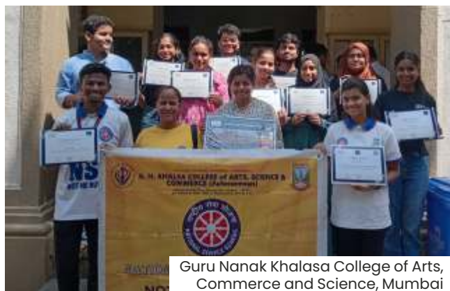
Guru Nanak Khalsa College of Arts, Commerce and Science, Mumbai