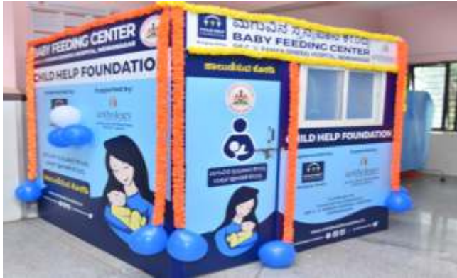
Sir C. V. Raman Hospital 1, Bengaluru Though the hospital is big, only 10 mothers use the centre daily