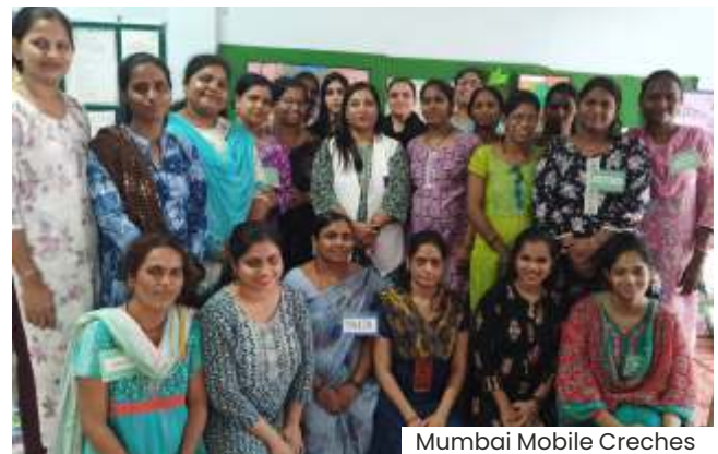
Mumbai Mobile Creches