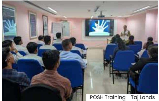
POSH Training – Taj Lands