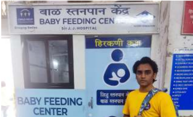
Sir J J Hospital, , Mumbai Functional BFC is present at the hospital