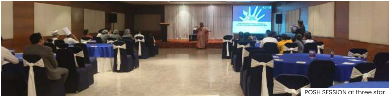
POSH SESSION at three star