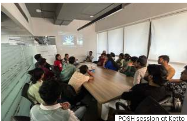
POSH session at Ketto