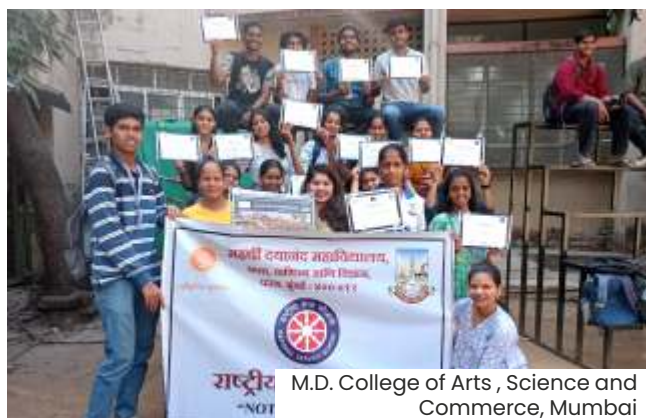
M.D. College of Arts, Science and Commerce, Mumbai