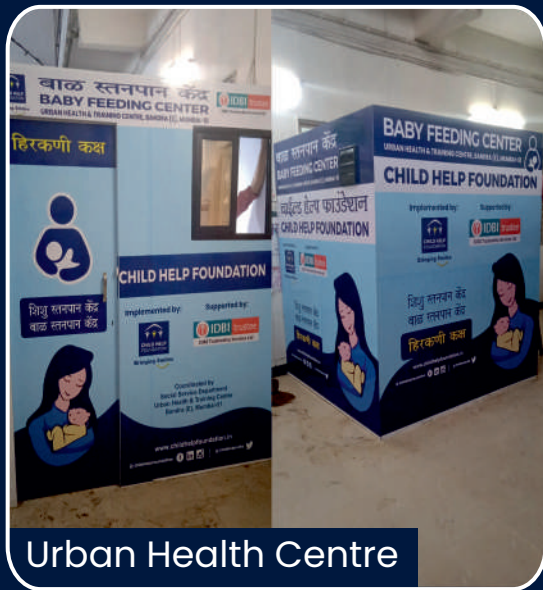
Urban Health Centre