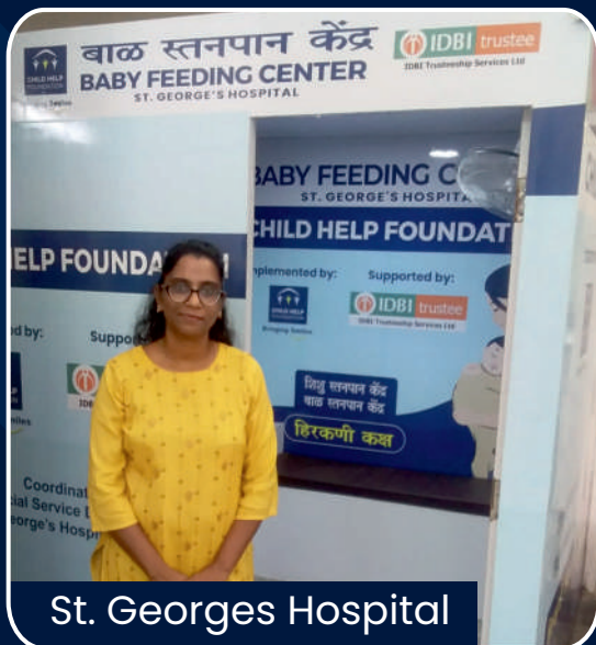
St. Georges Hospital