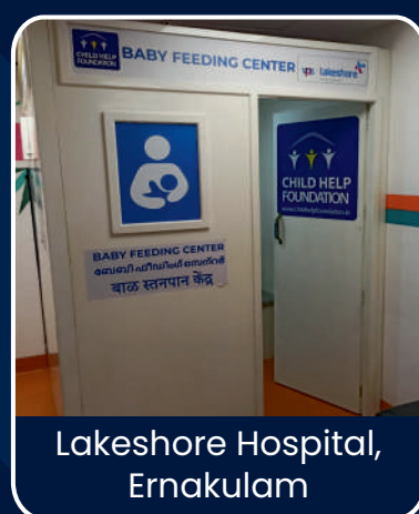
Lakeshore Hospital, Ernakulam