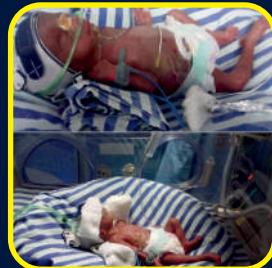
Twins of Lakshmi