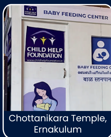
Chottanikara Temple, Ernakulam