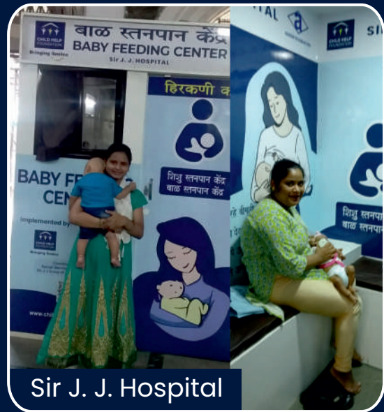
Sir J. J. Hospital