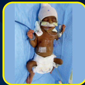
B/O Laxmi Twin 2 10 Days Premature Birth Complications