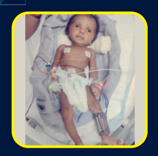
Baby of Soni Congenital Heart Disease