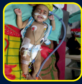
Lakshmi Reddy 7 months Respiratory Defect