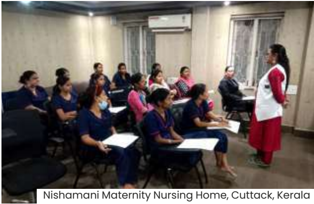
Nishamani Maternity Nursing Home, Cuttack, Kerala