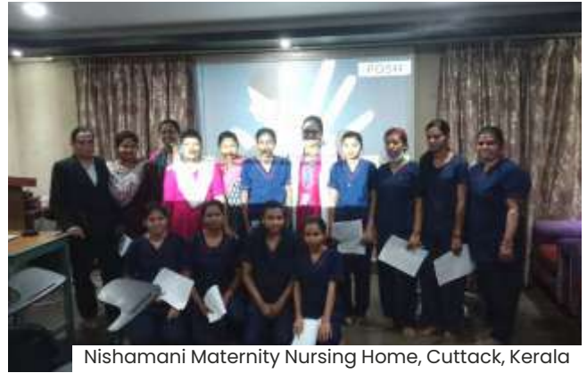
Nishamani Maternity Nursing Home, Cuttack, Kerala