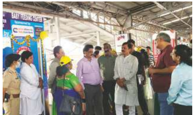
Vizag Railway Station 420 beneficiaries 15 mothers use it daily