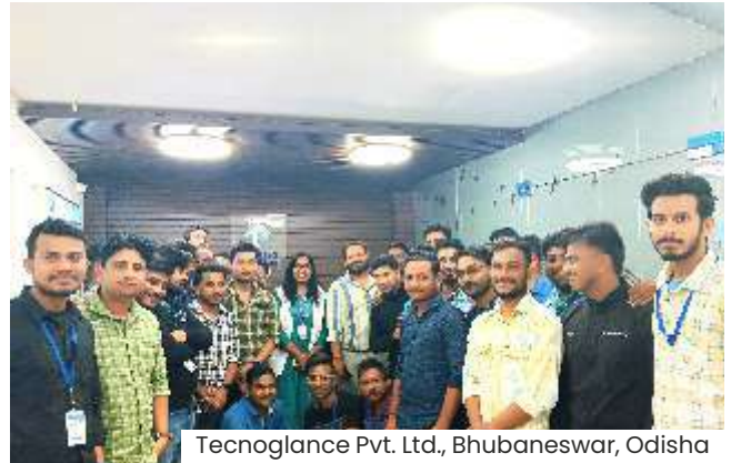
Tecnog lance Pvt. Ltd., Bhubaneswar, Odisha