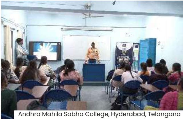
Andhra Mahila Sabha College, Hyderabad, Telangana