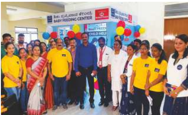
Sir Atal Bihari Vajpayee College-1 700 beneficiaries 25 mothers use it daily