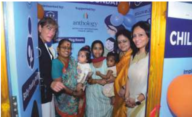
Institute for Child Health & Hospital for Children Egmore, Chennai 560 beneficiaries, well-utilized