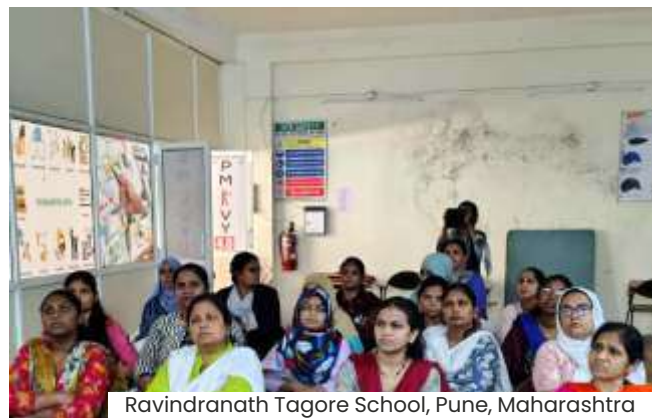
Ravindranath Tagore School, Pune, Maharashtra