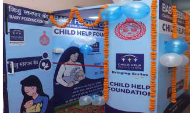
Puri Railway Station 560 beneficiaries regularly cleaned by railway staff; 20 users daily.