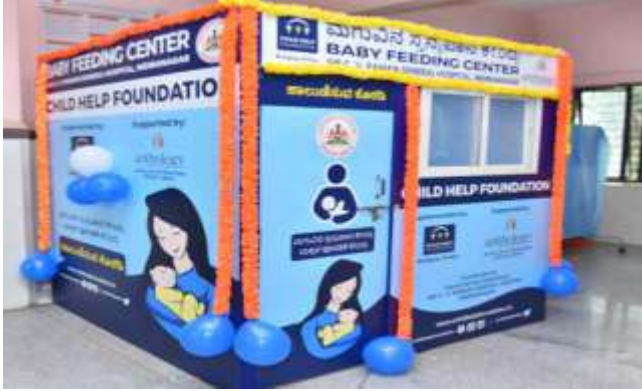
Sir C. V. Raman Hospital 1 Bengaluru 56 beneficiaries