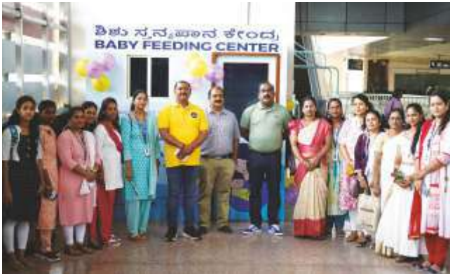
Yashwantpura Metro Station 1240 beneficiaries Remark: An average of 30 women use daily.