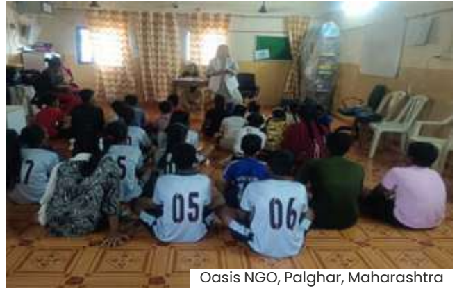
Oasis NGO, Palghar, Maharashtra

POCSO Session: A comprehensive training session was conducted at Oasis NGO (Palghar) for children from the Nallasopara Community Center, focusing on child safety and protection. The session covered crucial topics such as the POCSO (Protection of Children from Sexual Offences) Act , the concept of Good Touch & Bad Touch , and practical ways for children to identify, report, and prevent child sexual abuse . Through engaging discussions and interactive learning methods, the children were empowered with knowledge and awareness, equipping them with the confidence to safeguard themselves and others. By organizing such vital awareness programs, Child Help Foundation (CHF) continues its mission to protect and educate young minds, ensuring they grow up in a safer and more informed environment.