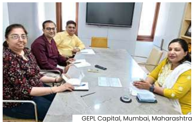
GEPL Capital, Mumbai, Maharashtra

On February 25, 2025 , GEPL Capital in Mumbai hosted the quarterly POSH-ICC meeting , marking a significant step toward strengthening workplace safety and gender equality. During this session, the Internal Complaints Committee (ICC) was formally constituted, ensuring compliance with the Prevention of Sexual Harassment (POSH) Act and reinforcing a safe and respectful work environment. Additionally, the POSH agreement was officially signed, underscoring the organization's commitment to addressing and preventing workplace harassment. By implementing such proactive measures, GEPL Capital , in collaboration with Child Help Foundation (CHF) , continues to advocate for workplace safety, gender sensitivity, and the well-being of employees.