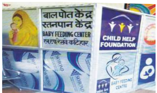
Katihar Railway Station 28 beneficiaries