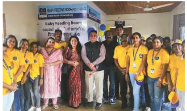
Shoranur Railway Station 420 beneficiaries; 15 mothers use it daily