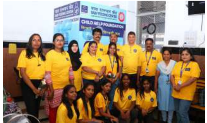
Pune Railway Station