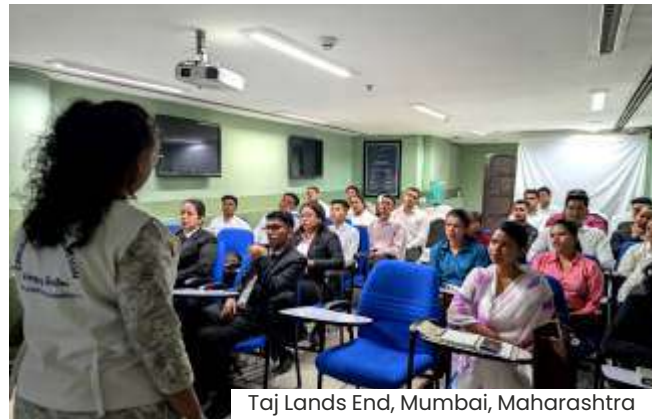
Taj Lands End, Mumbai, Maharashtra