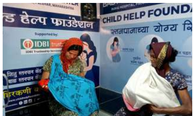
Rural Hospital, Palghar

224 beneficiaries 8 mothers use it daily.