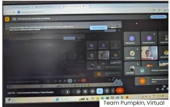
Team Pumpkin, Virtual