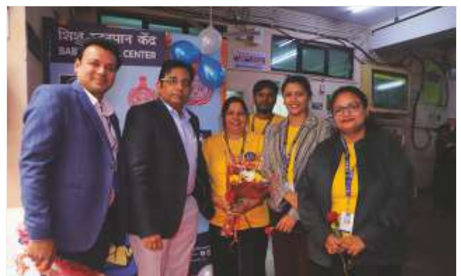
Civil Hospital Sector 10 Gurugram, Haryana A functional Baby Feeding Centre