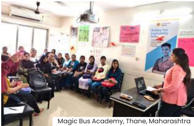
Magic Bus Academy, Thane, Maharashtra