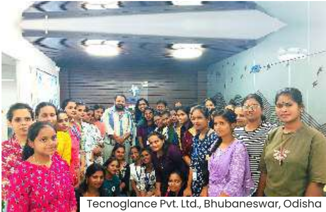
Tecnog lance Pvt. Ltd., Bhubaneswar, Odisha