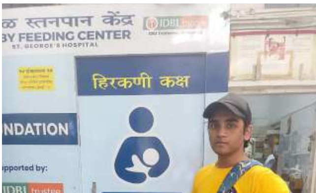
St George Hospital