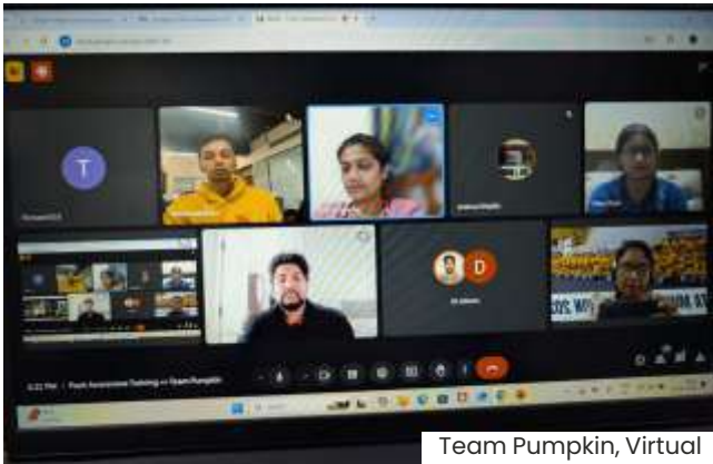
Team Pumpkin, Virtual