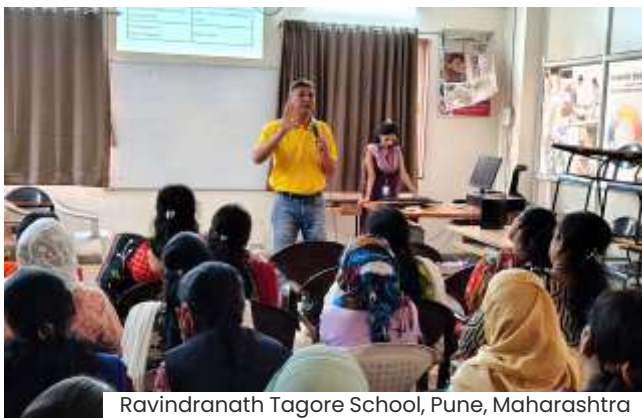
Ravindranath Tagore School, Pune, Maharashtra