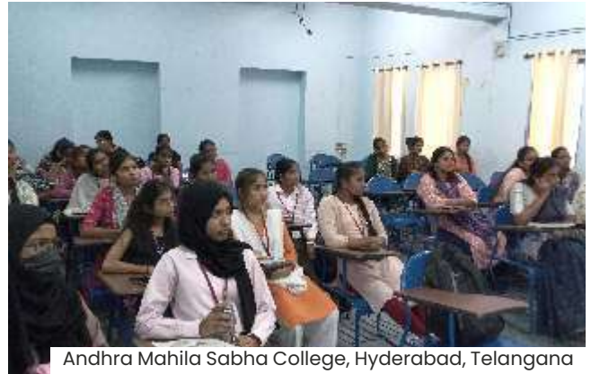
Andhra Mahila Sabha College, Hyderabad, Telangana