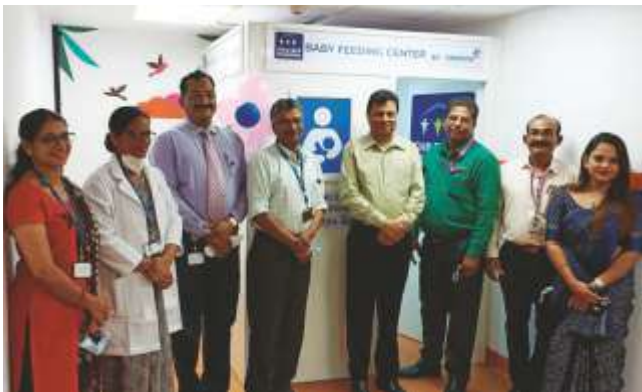
Lakeshore Hospital 420 beneficiaries 15 mothers use it daily