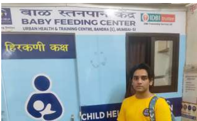
Urban Health Centre

112 beneficiaries 4 mothers use it daily