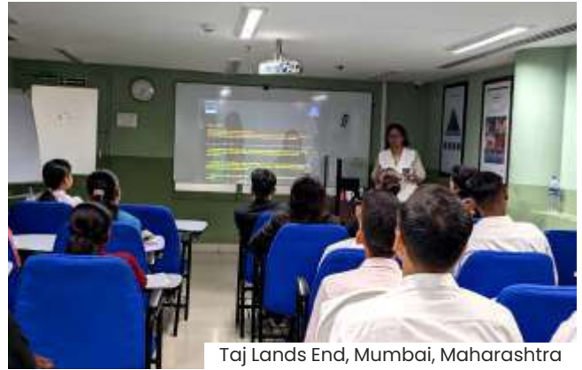
Taj Lands End, Mumbai, Maharashtra

POSH Sessions: Interactive and informative sessions were conducted at various institutions, including Taj Lands End (Mumbai), ITSP (Hyderabad), Magic Bus Academy (Thane), Ravindranath Tagore School (Pune), Nishamani Maternity Nursing Home (Cuttack), Andhra Mahila Sabha College (Hyderabad), Tecnog lance Pvt. Ltd. (Bhubaneswar), and Team Pumpkin (Virtual). These sessions engaged corporate employees, teachers, medical staff, students, and professionals, equipping them with knowledge about the POSH Act, workplace rights, and measures to create a harassment-free environment.