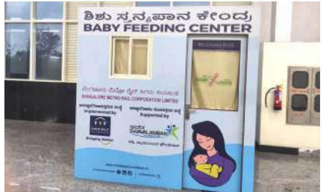
Baiyyappannahalli Metro Station 1395 beneficiaries Remark: An average of 45 mothers use daily.