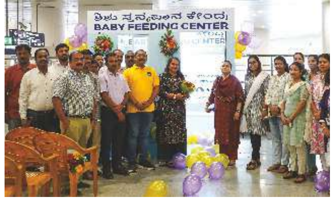
Majestic Metro Railway Station Bengaluru 672 beneficiaries; 24 mothers use it daily