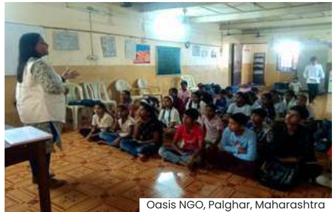
Oasis NGO, Palghar, Maharashtra

On February 25, 2025 , GEPL Capital in Mumbai hosted the quarterly POSH-ICC meeting , marking a significant step toward strengthening workplace safety and gender equality. During this session, the Internal Complaints Committee (ICC) was formally constituted, ensuring compliance with the Prevention of Sexual Harassment (POSH) Act and reinforcing a safe and respectful work environment. Additionally, the POSH agreement was officially signed, underscoring the organization's commitment to addressing and preventing workplace harassment. By implementing such proactive measures, GEPL Capital , in collaboration with Child Help Foundation (CHF) , continues to advocate for workplace safety, gender sensitivity, and the well-being of employees.