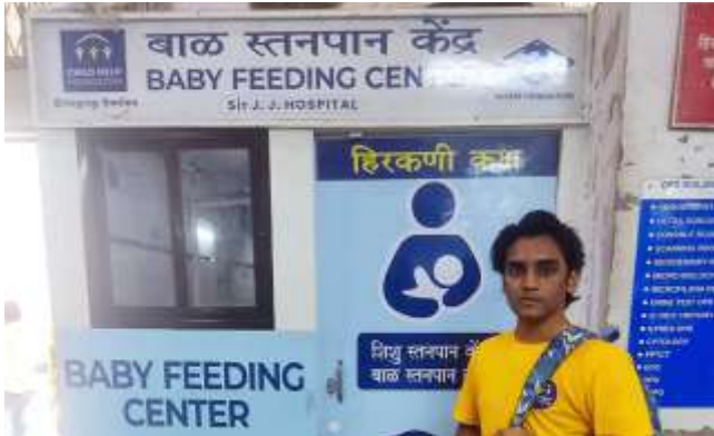
Sir J J Hospital