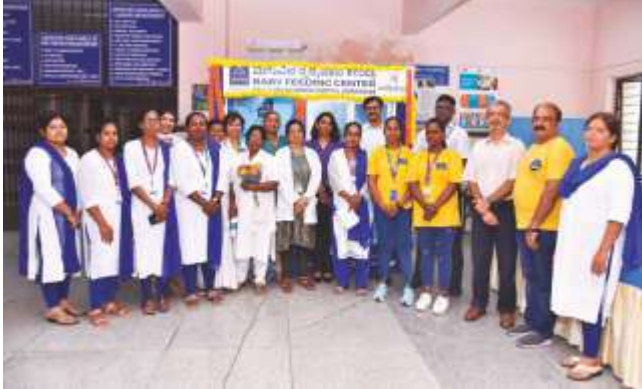
Taluk General Hospital Chennai 420 beneficiaries 15 mothers use it daily.