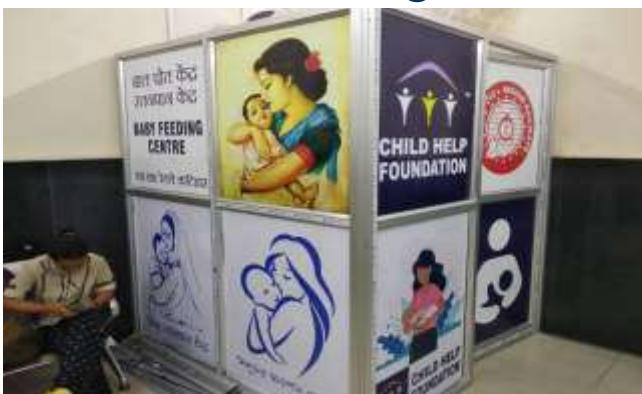
New Jalpaiguri Railway Station A functional Baby Feeding Centre is at the station.