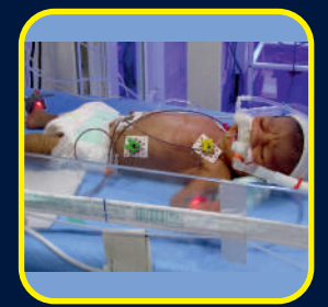
Baby of Janagam l day Respiratory Distress