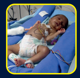
Baby of Laya 3 days Respiratory Distress