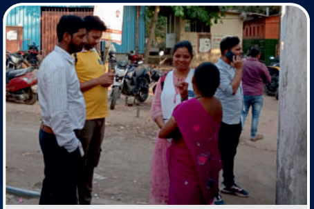
Visit to Aarey Colony