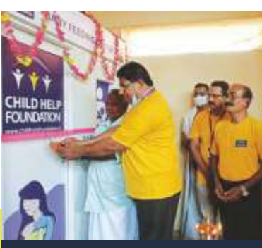
Chottanikkara Temple Kerala