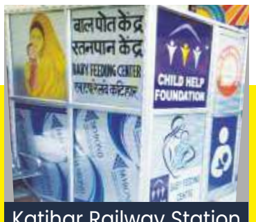
Katihar Railway Station Bihar