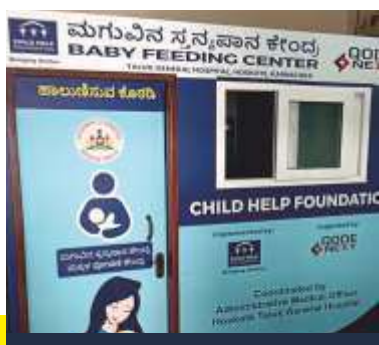
Taluk General Hospital Hoskote, Karnataka