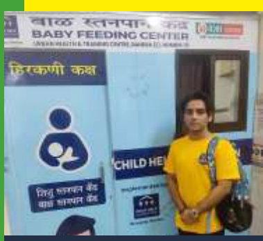
Urban Health Centre Maharashtra