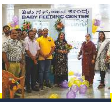
Majestic Metro Station Karnataka