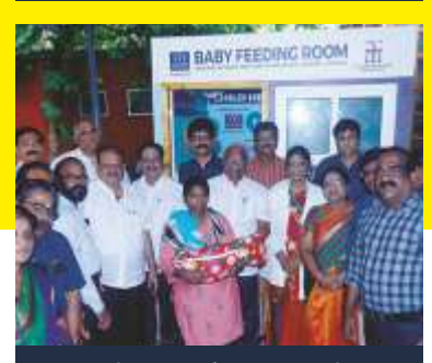
Institute of Obstetrics and Gynaecology Egmore Chennai, Tamil Nadu