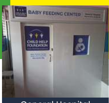
General Hospital Ernakulam, Kerala