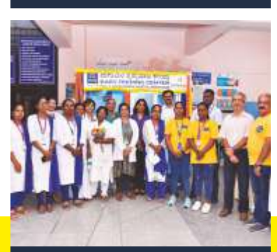
C. V Raman Hospital Karnataka