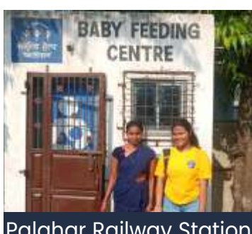
Palghar Railway Station Maharashtra