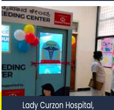
Lady Curzon Hospital, Shri Atal Bihari Vajpayee College Karnataka