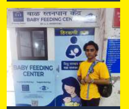
Sir J.J. Hospital Maharashtra