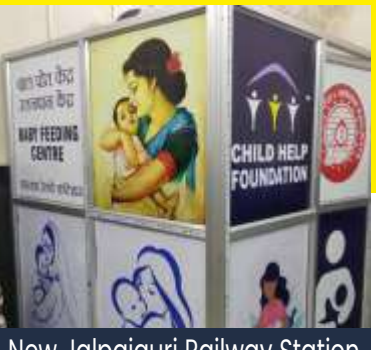
New Jalpaiguri Railway Station West Bengal