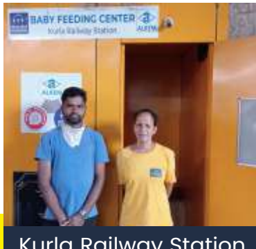
Kurla Railway Station Maharashtra