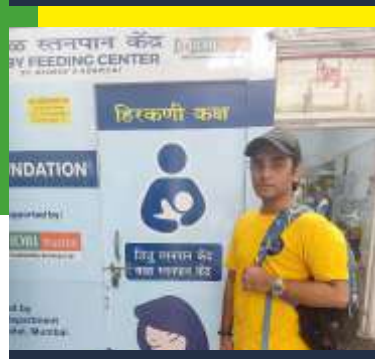
St. George's Hospital Maharashtra