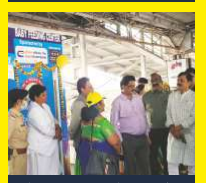
Visakhapatnam Railway Station Andhra Pradesh