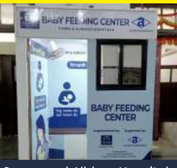
Cama and Albless Hospitals Maharashtra