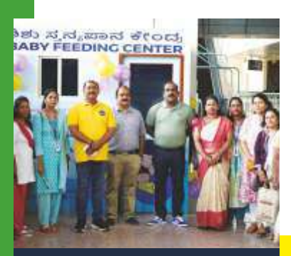
Yeshwantpur Metro Station Karnataka