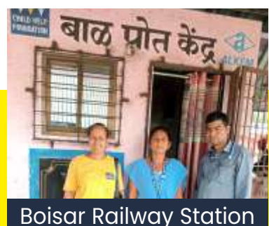
Boisar Railway Statior Maharashtra