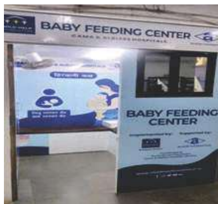
Cama & Albless Hospital Mumbai, Suburb