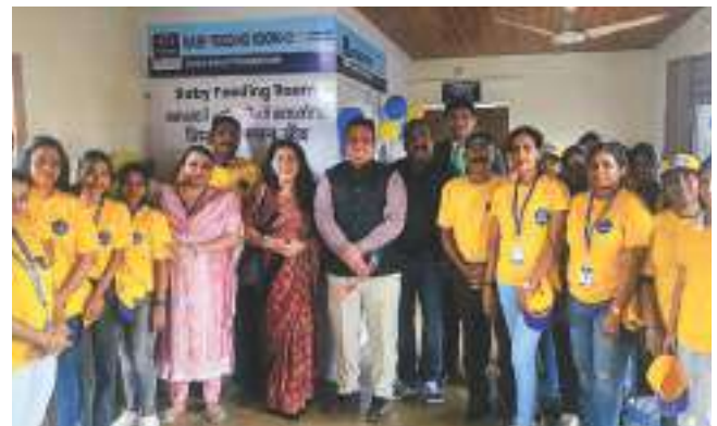
Shornur Railway Station Palakkad District