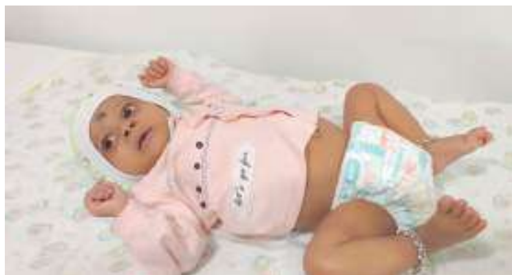
Vishwajeet Funde, 6 Months Chronic Liver Disease.