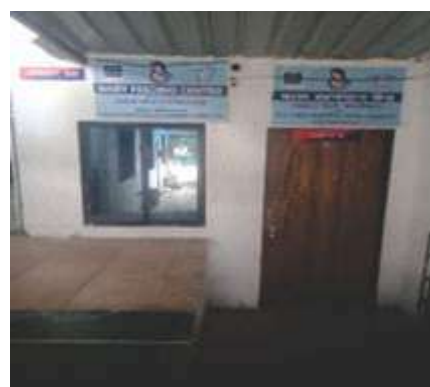
Kashimira Police Station Mumbai Suburb