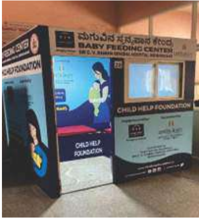
Sir C. V. Raman Hospital 1 Bengaluru