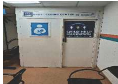
Lakeshore Hospital Kochi