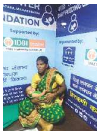
Civil Hospital Satara