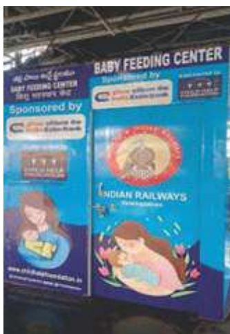
Vizag Railway Station Vishakhapatnam