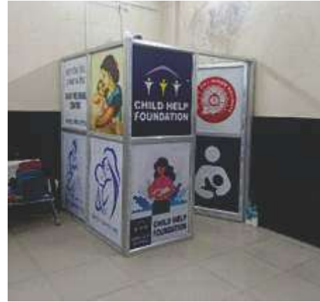
New Jalpaiguri Railway Station Jalpaiguri