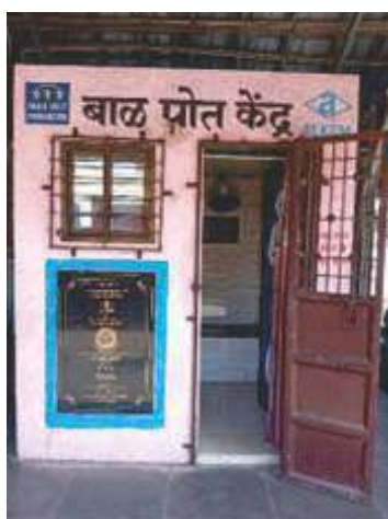
Boisar Railway Station Mumbai Suburb