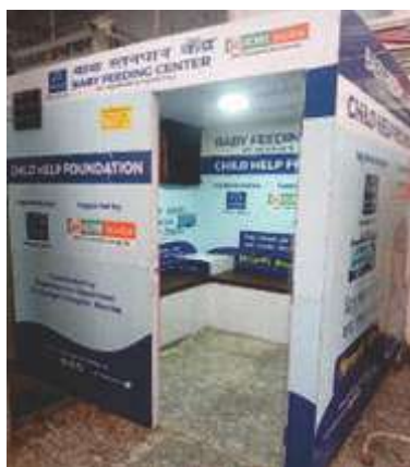
St. George's Hospital Mumbai