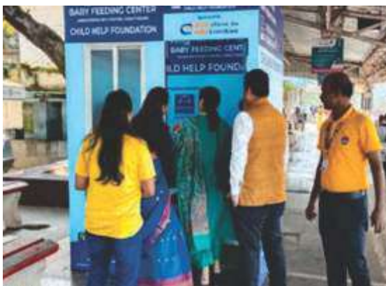
Jagdalpur Railway Station Chhattisgarh