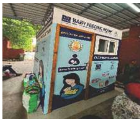
Institute of Obstetrics and Gynaecology Egmore, Chennai