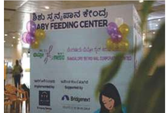
Yeshwantpur Metro Station Bengaluru