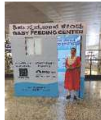
Majestic Metro Railway Station Bengaluru