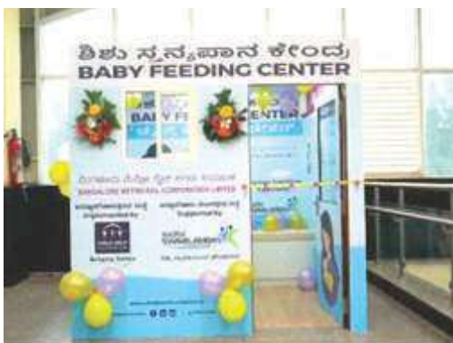
Baiyappanahalli Metro Station Bengaluru