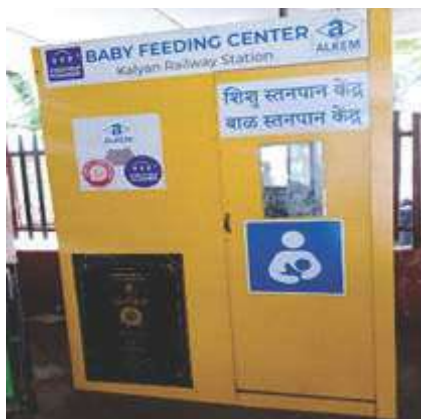
Kalyan Railway Station Mumbai Suburb