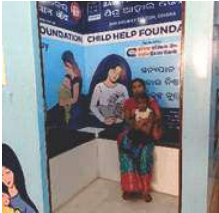
Puri Railway Station Puri