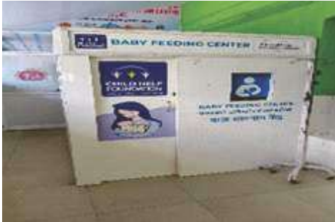
General Hospital Thiruvananthapuram