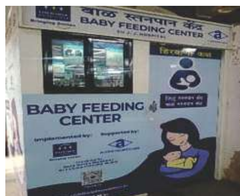
Sir J.J. Hospital Mumbai, Suburb