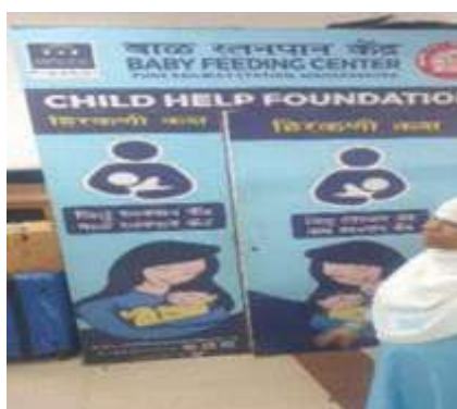
Pune Railway Station Pune