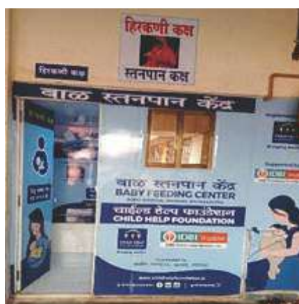
Rural Hospital Palghar