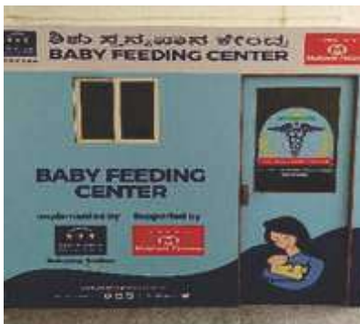
Sir Atal Bihari Vajpayee College Bengaluru