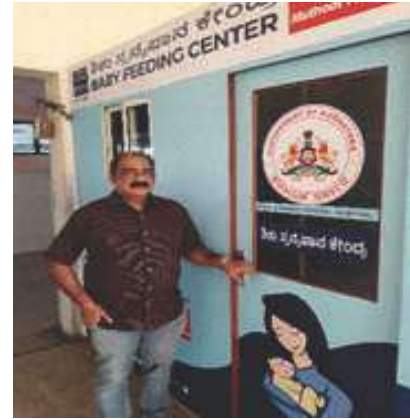
Sir C.V. Raman General Hospital, 2 Bengaluru