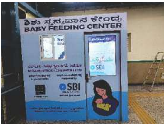
Rashtriya Vidyalaya Road and Metro Stations Bengaluru