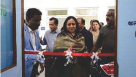
Kengeri Bus Terminal Metro Station Bengaluru