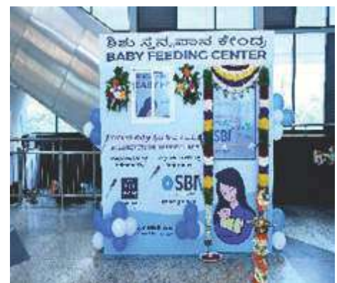
Benniganahalli Metro Station Bengaluru