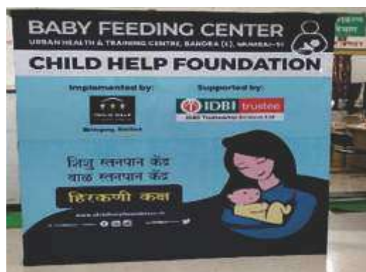
Urban Health Care Centre Mumbai