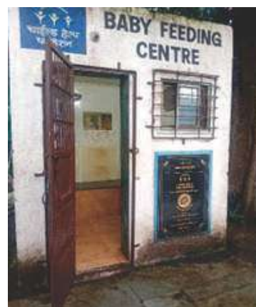
Palghar Railway Station Mumbai Suburb