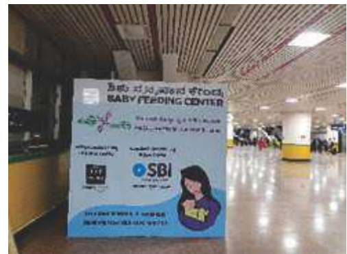
Banashankari Metro Stations Bengaluru