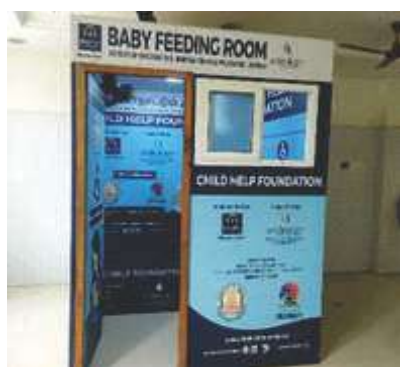
Institute for Child Health & Hospital for Children Egmore, Chennai