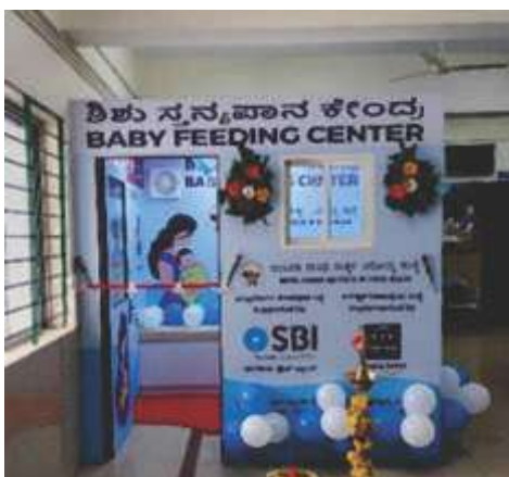
Indira Gandhi Institute of Child Health Hospital Bengaluru