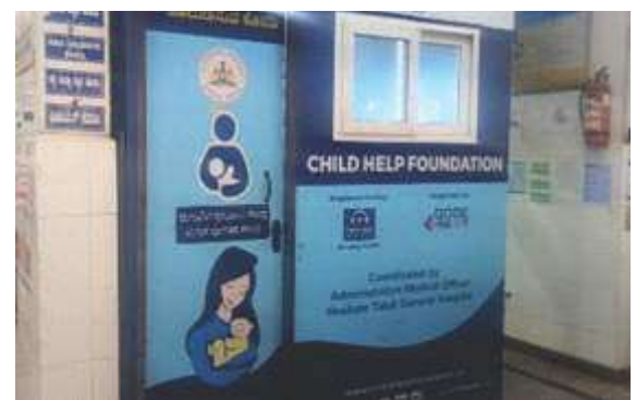
Taluk General Hospital Bengaluru