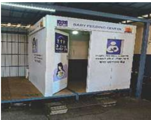
Chottanikkara Temple Kochi