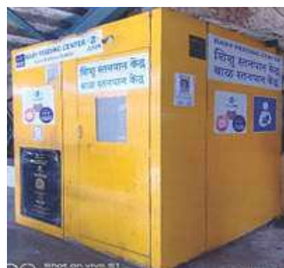
Kurla Railway Station Mumbai