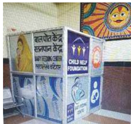
Katihar Railway Station Katihar