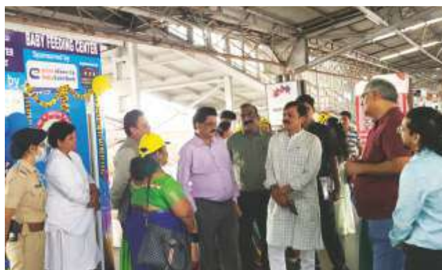
Vizag Railway Station Vizag 15 mothers use it daily