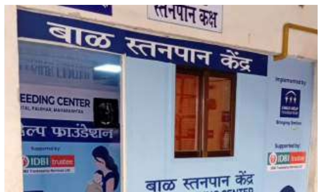
Rural Hospital, Palghar 180 beneficiaries; 6 mothers use it daily