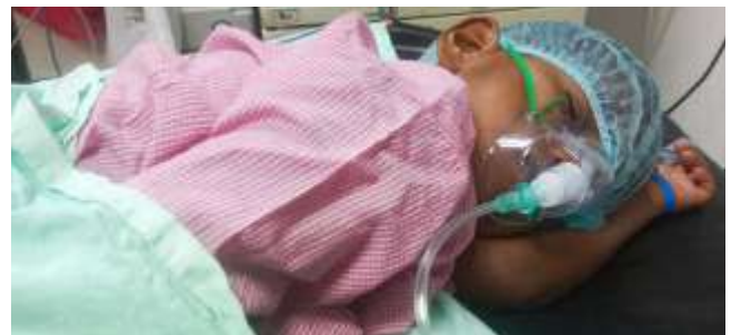
Kirubai Jensis , 5 Years Complex Heart Disease