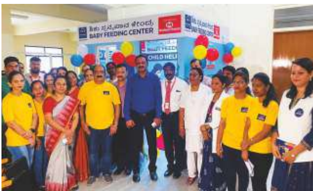
Sir Atal Bihari Vajpayee College-1 Bengaluru 27 mothers use it daily