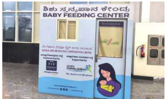
Baiyyappanahalli Metro Station Bengaluru 49 users per month