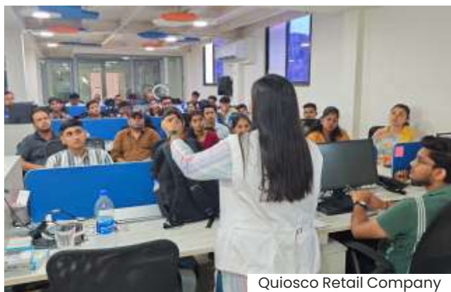
Quiosco Retail Company