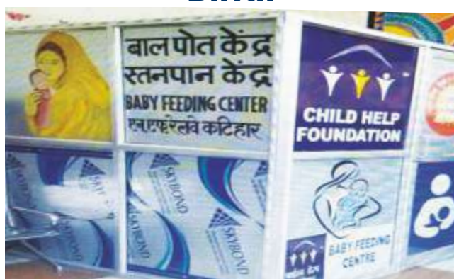
Katihar Railway Station Katihar 31 beneficiaries