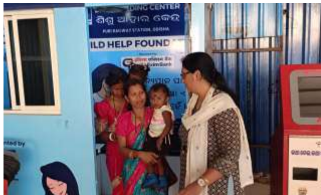
Puri Railway Station, Puri 620 beneficiaries; regularly cleaned by railway staff; 20 users daily