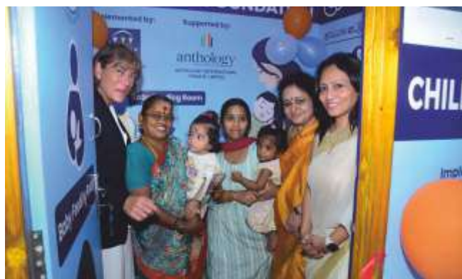
Institute for Child Health & Hospital for Children Chennai 15 mothers use it daily; well-utilized