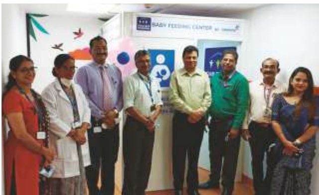
Lakeshore Hospital Ernakulam 900 beneficiaries; 30 mothers use it daily