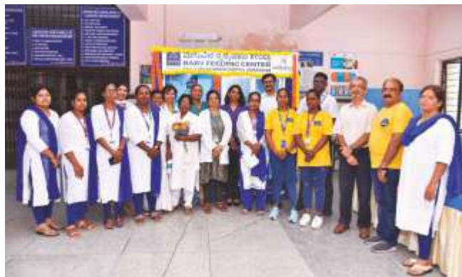
Taluk General Hospital Chennai 15 mothers use it daily