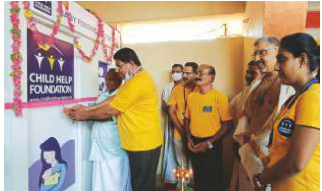
Chottanikkara Temple, Ernakulam 1,800 beneficiaries; 60 mothers use it daily; heavily used due to large crowds