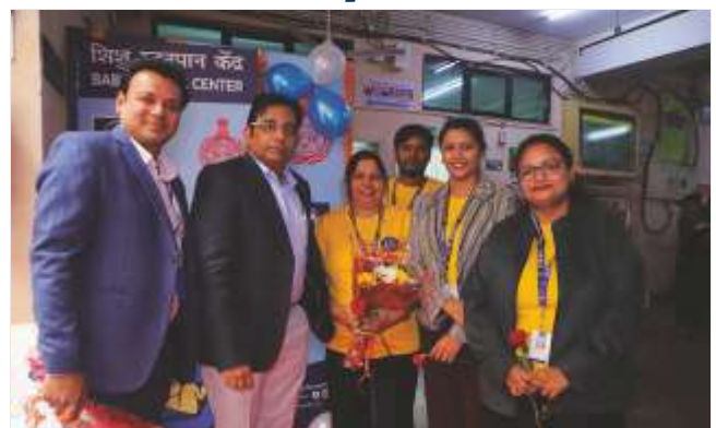
Civil Hospital Sector 10 Gurugram A functional Baby Feeding Centre