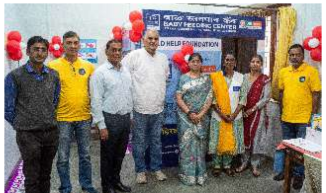
Civil Hospital, Satara 124 beneficiaries; 4 mothers use it daily