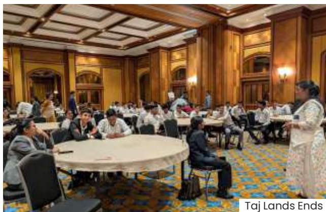
Taj Lands Ends