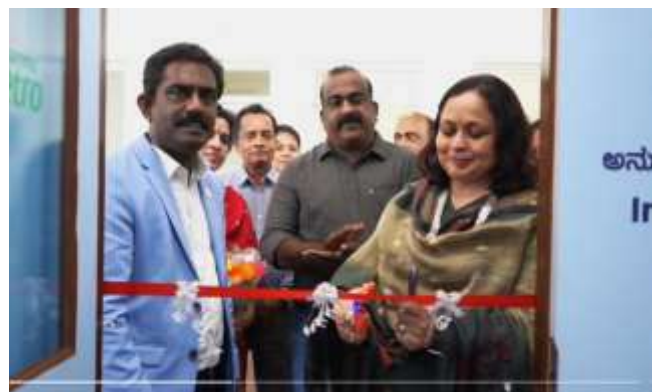
Kengeri Bus Terminal Metro Station Bengaluru 127 users per month