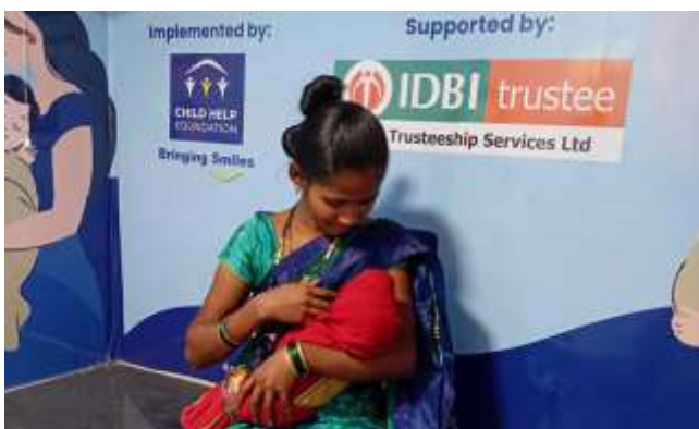
Urban Health Centre, Mumbai 248 beneficiaries;