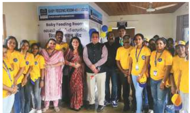
Shoranur Railway Station Shoranur 450 beneficiaries; 15 mothers use it daily