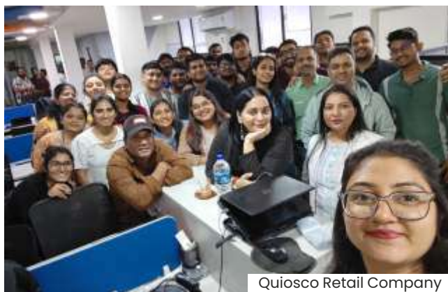
Quiosco Retail Company