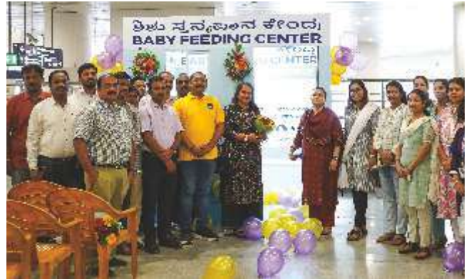
Majestic Metro Railway Station Bengaluru 29 mothers use it daily