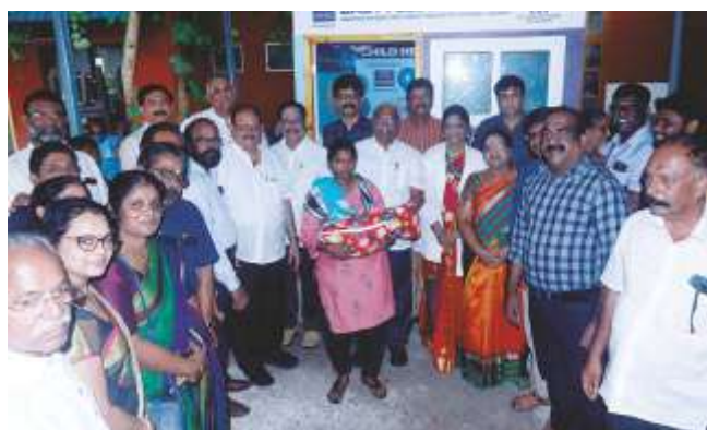
Institute of Obstetrics and Gynaecology Chennai 15 mothers use it daily