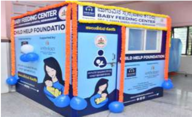
Sir C. V. Raman Hospital 1 & 2 Bengaluru 10 mothers use it daily