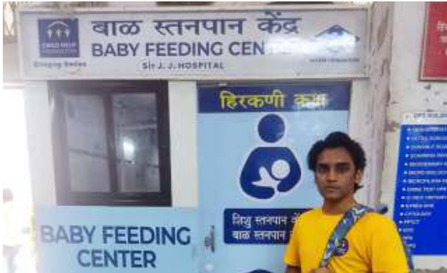
Sir J J Hospital, , Mumbai 31 beneficiaries;