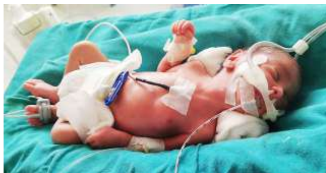
Baby of Saloni Twin II, 9 Days Premature Birth Complications