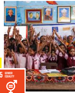
5 GENDER EQUALITY