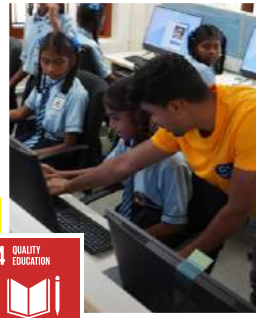
4 QUALITY EDUCATION