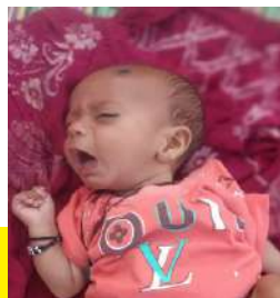
Yuvi 2.5 Months Heart Disease