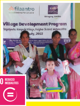
10 REDUCED INEQUALITIES