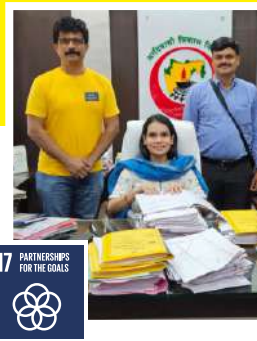
17 PARTNERSHIPS FOR THE GOALS