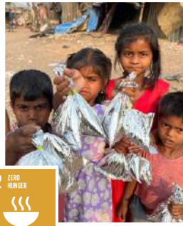
2 ZERO HUNGER