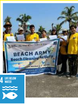
14 LIFE BELOW WATER