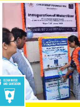
6 CLEAN WATER AND SANITATION