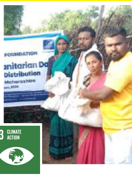
13 CLIMATE ACTION