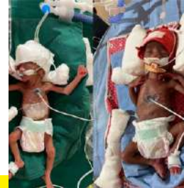
Twins of Shalini 5 Days Premature Birth Complications