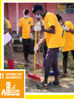
11 SUSTAINABLE CITIES AND COMMUNITIES