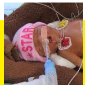
B/O Kalpana 1 Day Premature Birth Complications