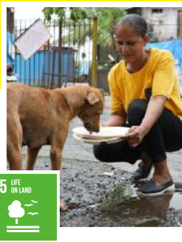
15 LIFE ON LAND