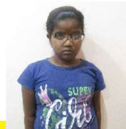
S Buji 14 Years Heart Disease