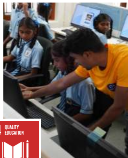
4 QUALITY EDUCATION