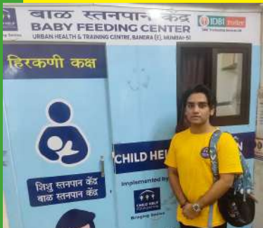
Urban Health Centre Maharashtra