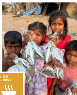
2 ZERO HUNGER