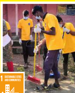
11 SUSTAINABLE CITIES AND COMMUNITIES