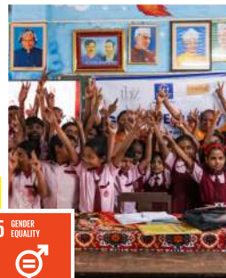
5 GENDER EQUALITY