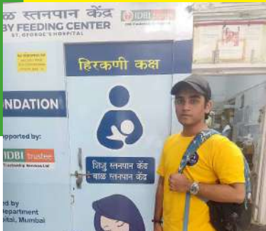
St. George's Hospital Maharashtra