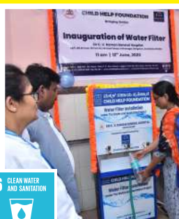
6 CLEAN WATER AND SANITATION