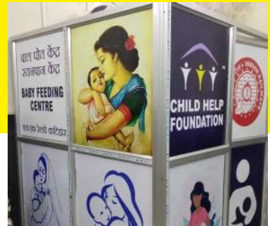
New Jalpaiguri Railway Station West Bengal