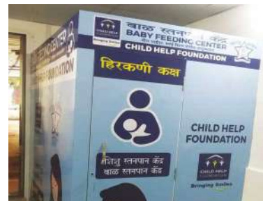
Kashimira Police Station Maharashtra