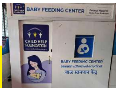
General Hospital Kerala