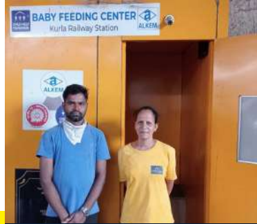
Kurla Railway Station Maharashtra