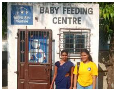
Boisar Railway Station Maharashtra