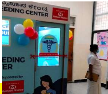
Lady Curzon Hospital, Shri Atal Bihari Vajpayee College Karnataka