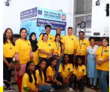
Pune Railway Station Maharashtra