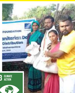
13 CLIMATE ACTION