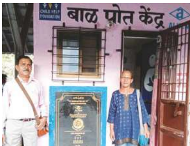
Palghar Railway Station Maharashtra

Child Help Foundation volunteers visited Baby Feeding Centres to get updates on the maintenance of the centres. Centres at Palghar Railway Station (Maharashtra), Boisar Railway Station (Maharashtra), CAMA Hospital (Maharashtra), St. George's Hospital (Maharashtra), Sir JJ Hospital (Maharashtra), Urban Health Centre (Maharashtra), Pune Railway Station (Maharashtra) General Hospital (Kerala), Lakeshore Hospital (Kerala), Chottanikkara Temple (Kerala), Vizag Railway Station (Andhra Pradesh), CV Raman Hospital (Karnataka) and Shri Atal Bihari Vajpayee College (Karnataka) were found to be well-maintained and well-utilized. In Maharashtra's Kalyan and Kurla Railway Stations, the keys to the centres were handed over to the staff to guide the mothers using the centre. Signboards are being prepared for Kashimira Police Station in Maharashtra to indicate the presence of the centre. However, usage of centres at Katihar Railway Station (Bihar) and New Jalpaiguri Railway Station (West Bengal) was found to be average.