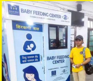
Cama and Albles Hospitals Maharashtra