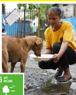
15 LIFE ON LAND