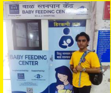
Sir J.J. Hospital Maharashtra