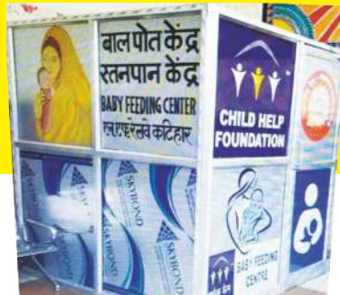
Katihar Railway Station Bihar