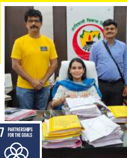
17 PARTNERSHIPS FOR THE GOALS