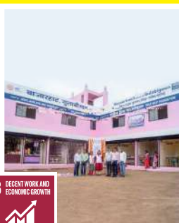
8 DECENT WORK AND ECONOMIC GROWTH