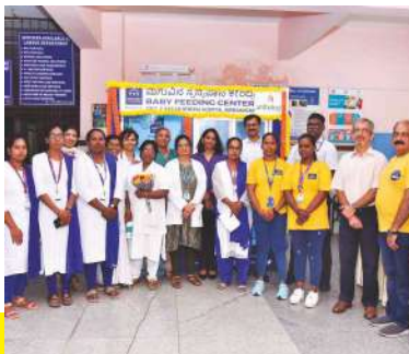
C. V Raman Hospital Karnataka