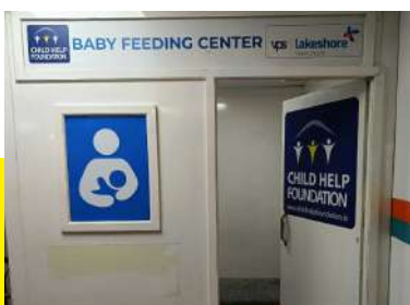
Lakeshore Hospital Kerala