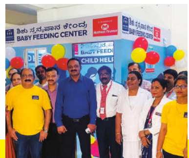
Shri Atal Bihari Vajpayee College Karnataka