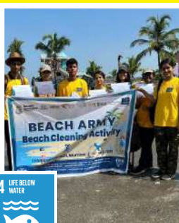
14 LIFE BELOW WATER