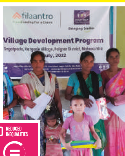
10 REDUCED INEQUALITIES