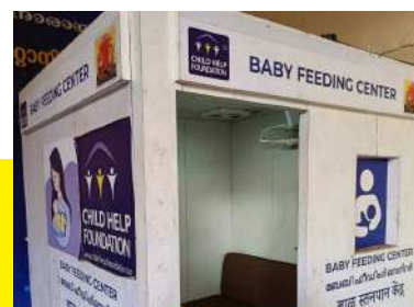
Chottanikkara Temple Kerala