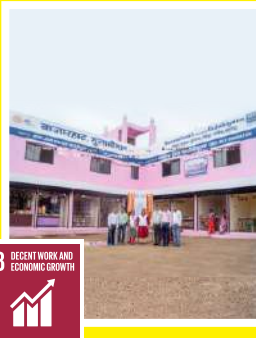
8 DECENT WORK AND ECONOMIC GROWTH