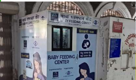
Sir J. J. Hospital Mumbai, Maharashtra