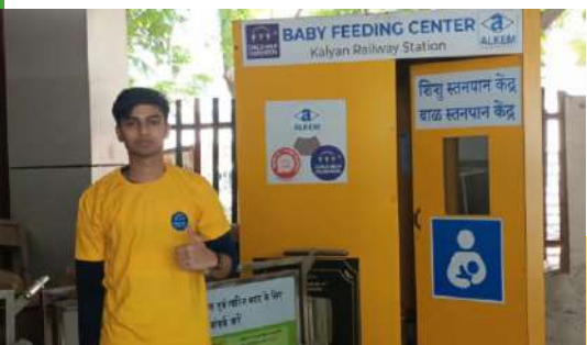
Kalyan Railway Station Mumbai, Maharashtra