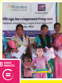
10 REDUCED INEQUALITIES