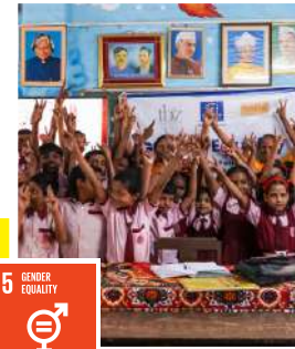
5 GENDER EQUALITY