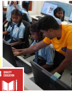
4 QUALITY EDUCATION