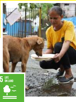
15 LIFE ON LAND