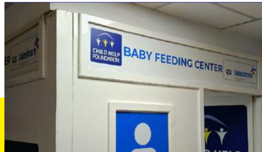
Lakeshore Hospital Kerala