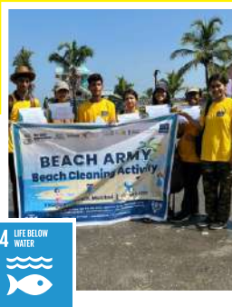
14 LIFE BELOW WATER