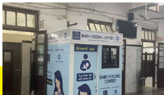
Cama & Alless Hospitals Fort, Mumbai, Maharashtra