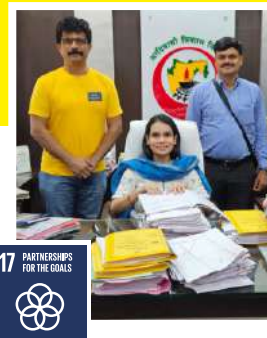
17 PARTNERSHIPS FOR THE GOALS