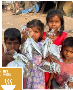
2 ZERO HUNGER