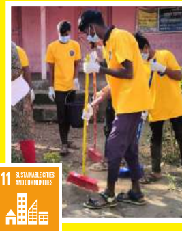
11 SUSTAINABLE CITIES AND COMMUNITIES