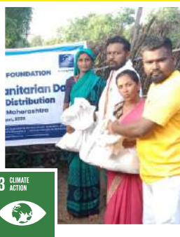
13 CLIMATE ACTION