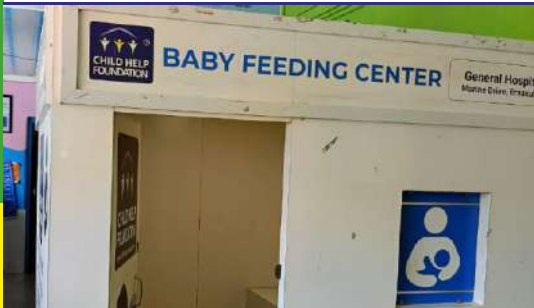
General Hospital Marine Drive, Ernakulam, Kerala