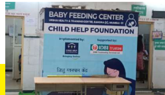
Urban Health & Training Centre Bandra(E), Mumbai, Maharashtra