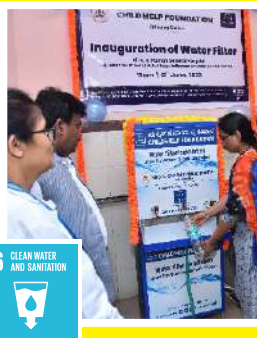
6 CLEAN WATER AND SANITATION