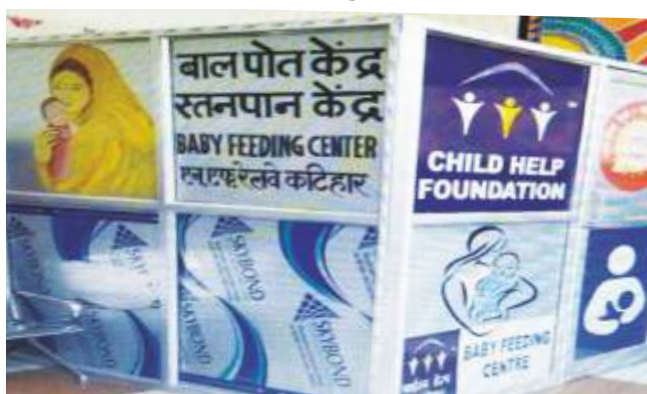
Katihar Railway Station Katihar, Bihar