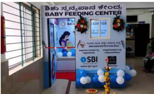
Indira Gandhi Institute of Child Health Hospital Bengaluru, Karnataka