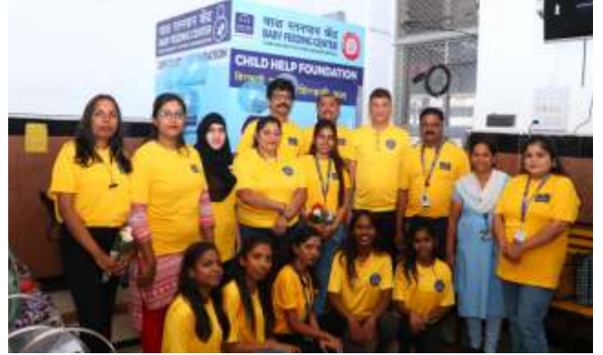
Pune Railway Station Pune, Maharashtra