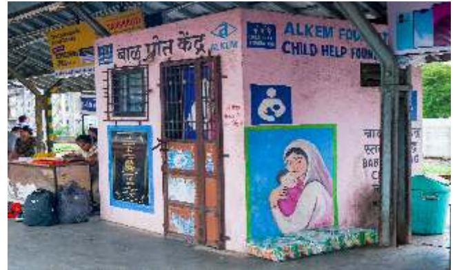
Boisar Railway Station Mumbai Suburb, Maharashtra