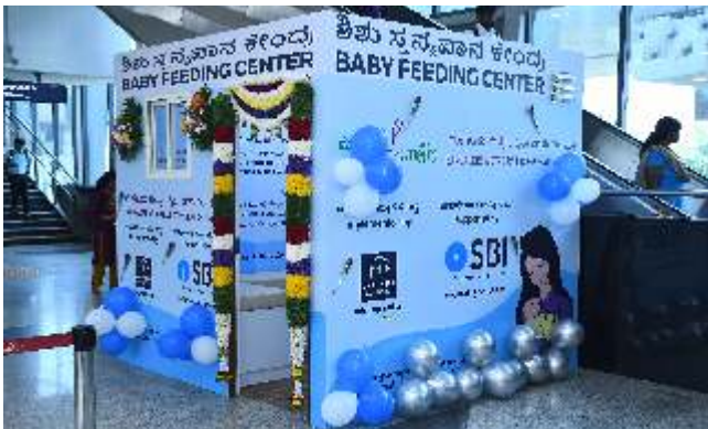
Benniganahalli Metro Station Bengaluru, Karnataka