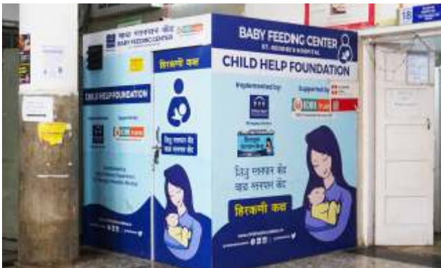
St George Hospital Mumbai, Maharashtra