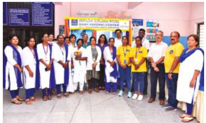
Taluk General Hospital Hoskote, Karnataka