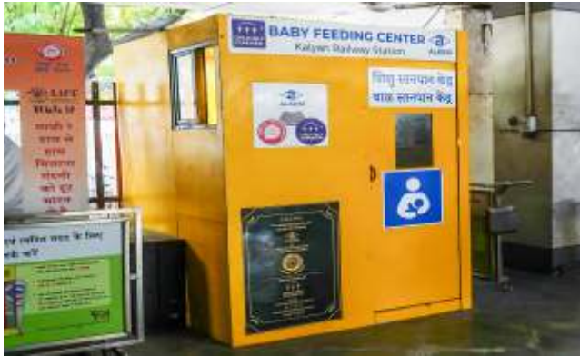
Kalyan Railway Station Mumbai Suburb, Maharashtra