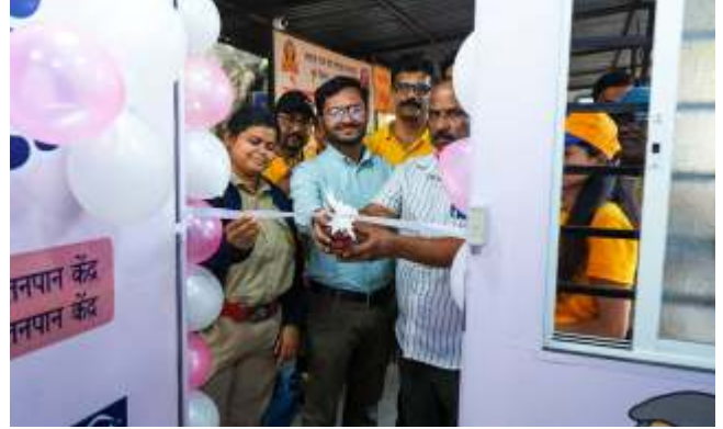
Swargate ST Stand Pune-2