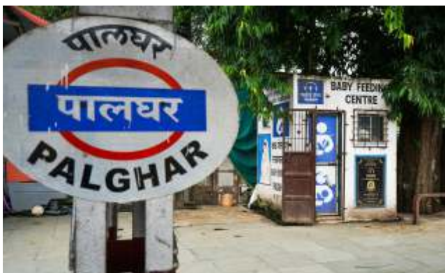
Palghar Railway Station Mumbai Suburb, Maharashtra