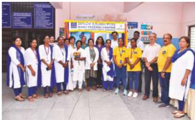
Taluk General Hospital Egmore, Chennai