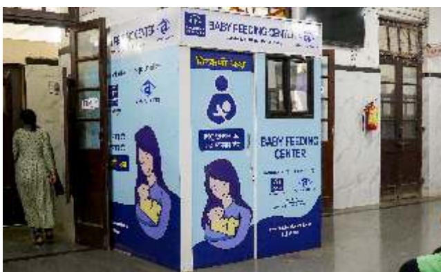
Cama & Albles Hospital Mumbai, Maharashtra