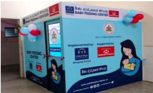
Sir C.V. Raman General Hospital 2 Bengaluru, Karnataka