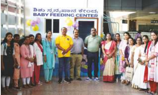
Yeshwantpur Metro Station Bengaluru, Karnataka