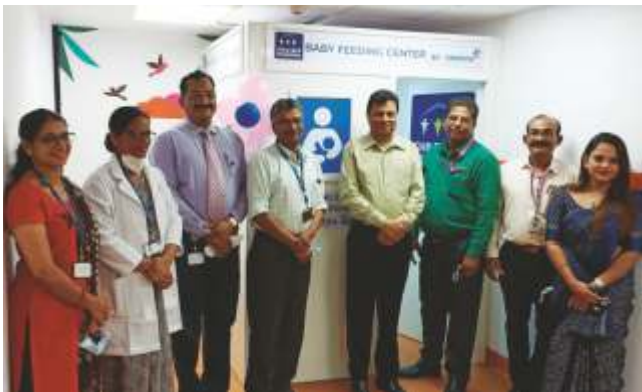
Lakeshore Hospital Ernakulam, Kochi