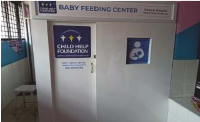
General Hospital Thiruvananthapuram, Ernakulam