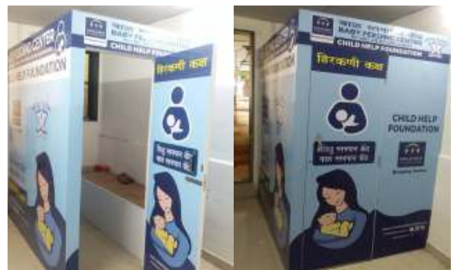
Kashimira Police Station Mumbai Suburb, Maharashtra