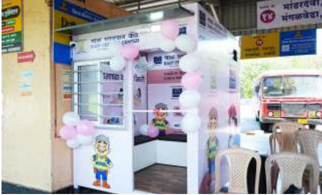
Swargate ST Stand Pune-1