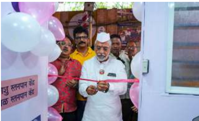
Shreemant Dagdusheth Halwai Ganapati Temple Pune