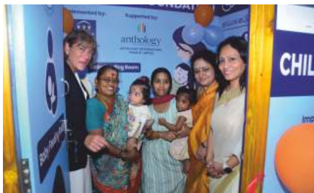
Institute for Child Health & Hospital for Children Egmore, Chennai