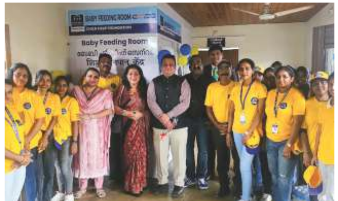
Shoranur Railway Station Shoranur, Palakkad District