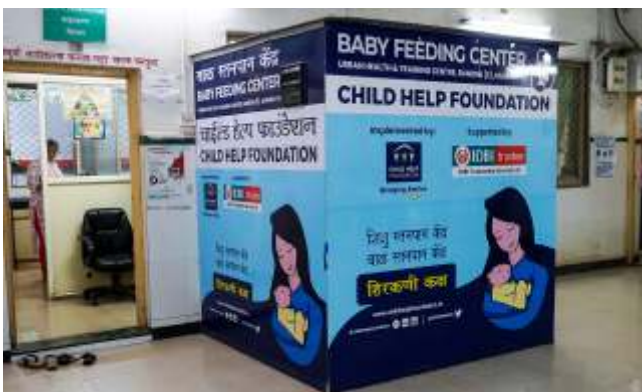
Urban Health Centre Mumbai, Maharashtra