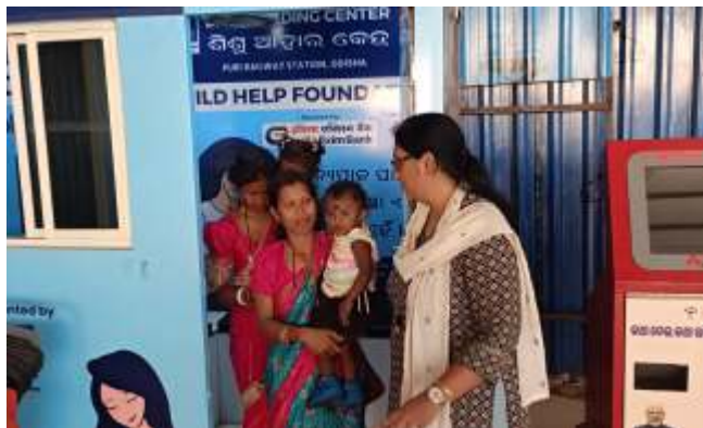
Puri Railway Station Puri, Odisha