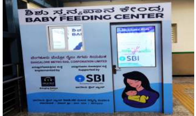
RV Road Metro Station Bengaluru, Karnataka