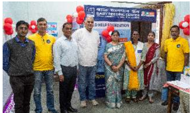
Civil Hospital Satara, Maharashtra