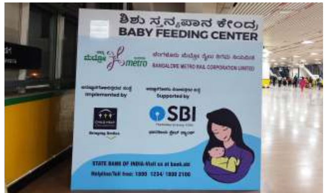
Banashankari Metro Stations Bengaluru, Karnataka