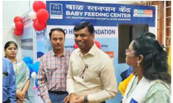
Krantsinh Nana Patil Civil Hospital Satara