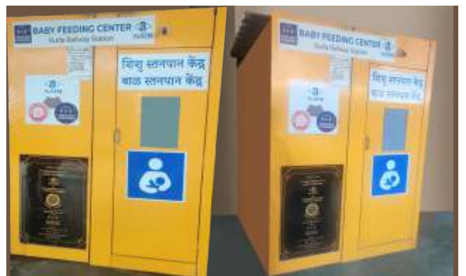
Kurla Railway Station Mumbai, Maharashtra