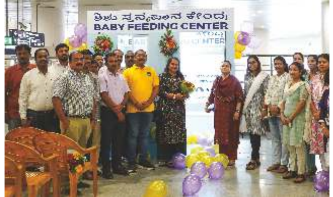
Majestic Metro Railway Station Bengaluru, Karnataka