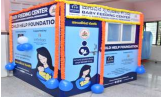
Sir C. V. Raman Hospital 1 Bengaluru, Karnataka