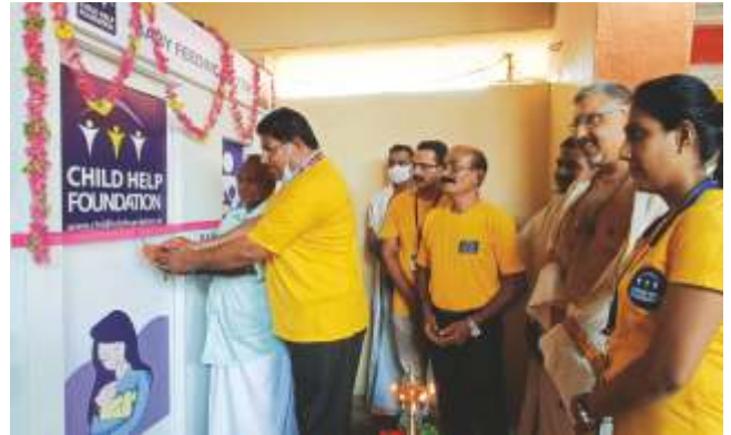
Chottanikkara Temple Ernakulam, Kochi