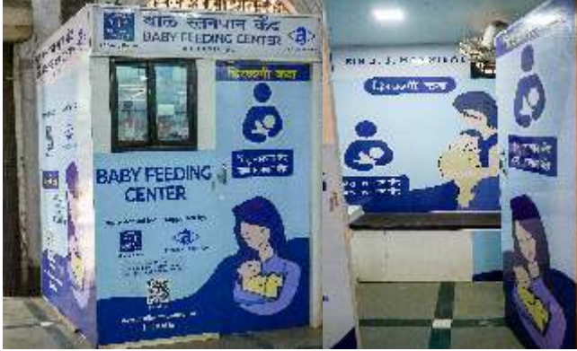
Sir J J Hospital Mumbai, Maharashtra