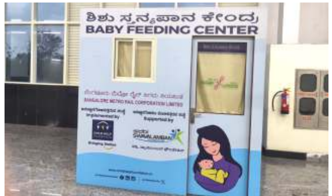
Baiyappanahalli Metro Station Bengaluru, Karnataka