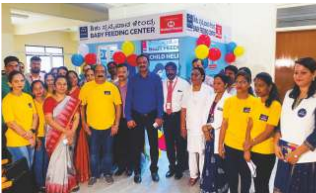
Sir Atal Bihari Vajpayee College Bengaluru, Karnataka