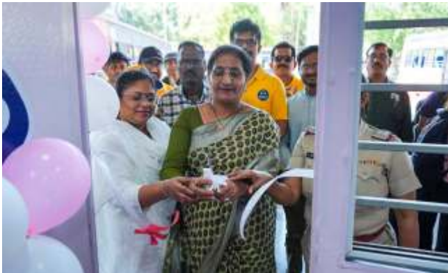
Wakadewadi ST Depot Pune