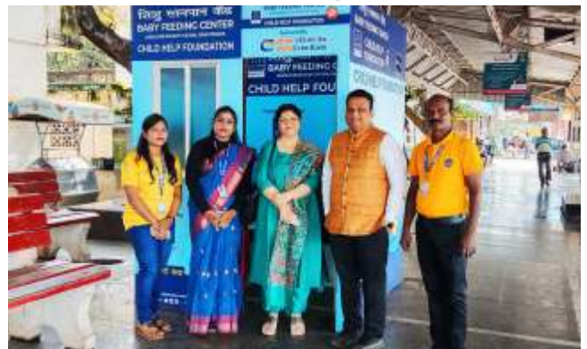
Jagdalpur Railway Station Jagdalpur