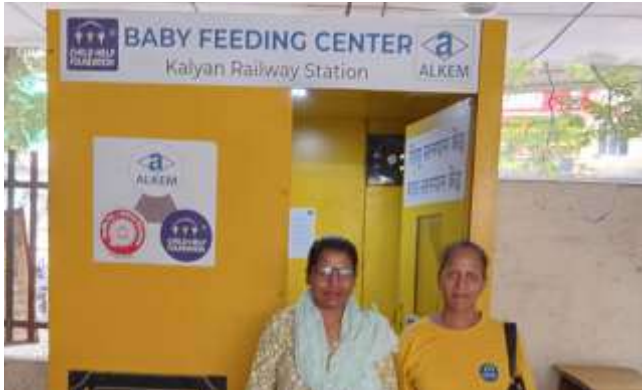
Kalyan Railway Station, Thane 120 beneficiaries; 4 mothers use it daily; supported by Childline staff.