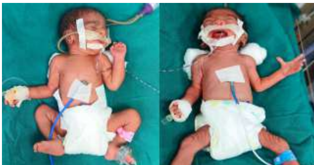
Babies of Shikha , 3 Days Premature Birth Complications