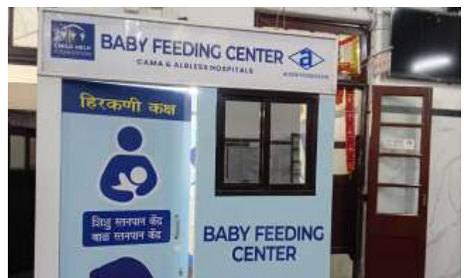
Cama & Albles Hospital, Mumbai 150 beneficiaries; excellent utilization in ANC OPD with nursing staff support