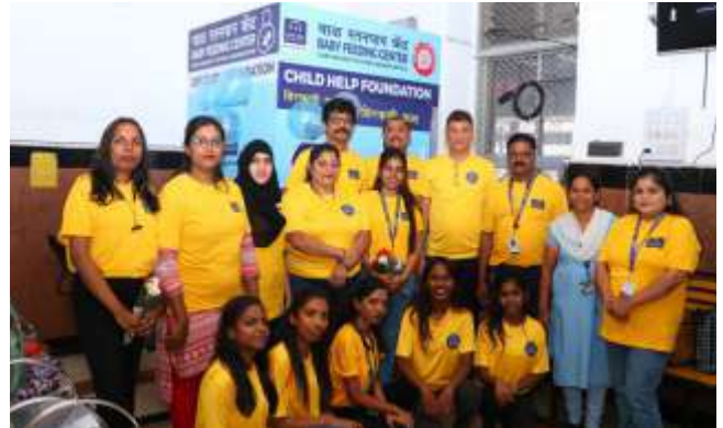
Pune Railway Station, Pune 120 beneficiaries; needs better maintenance by railway authorities