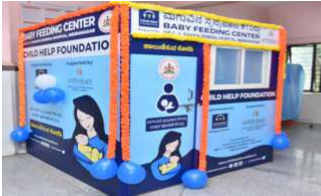
Sir C. V. Raman Hospital 1 & 2 Bengaluru 300 beneficiaries; 10 mothers use it daily