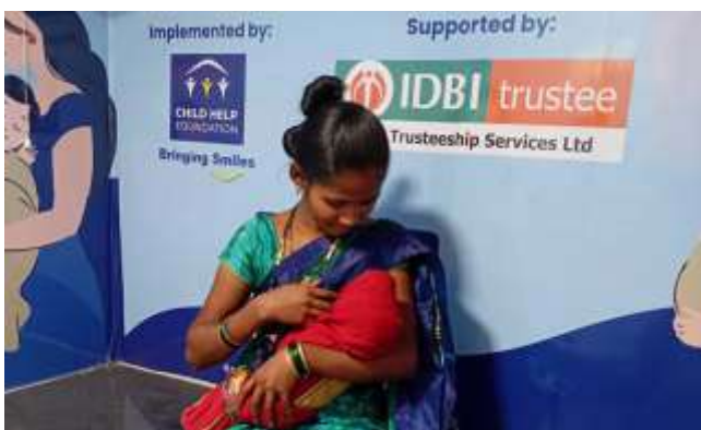
Urban Health Centre, Mumbai 240 beneficiaries; very well maintained