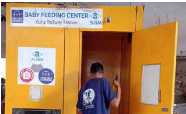
Kurla Railway Station, Thane 30 beneficiaries