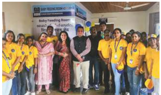
Shoranur Railway Station Shoranur 450 beneficiaries; 15 mothers use it daily