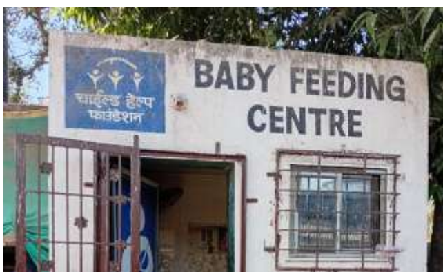
Palghar Railway Station, Palghar 120 beneficiaries; 4 mothers use it daily