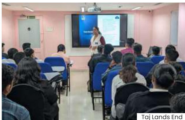
Taj Lands End