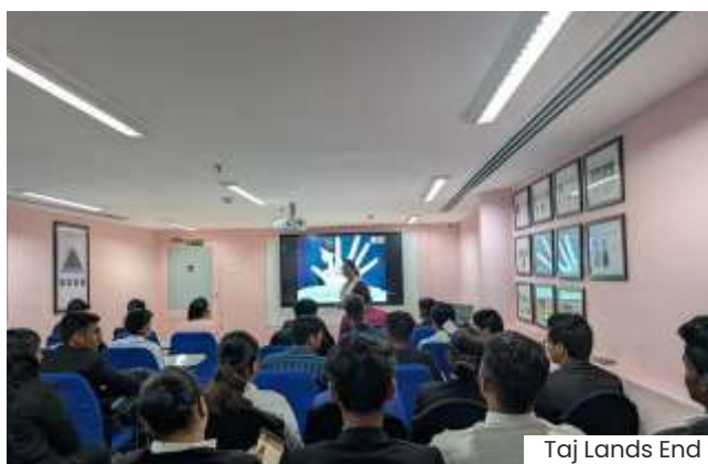
Taj Lands End