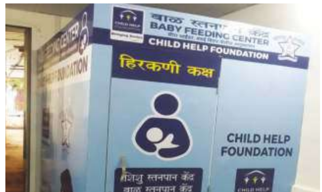
Kashimira Police Station, Mumbai Suburban 30 beneficiaries; 1 mother uses it daily; also used for resting