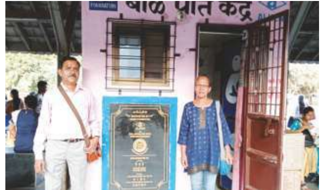
Boisar Railway Station, Palghar 90 beneficiaries; located on Platform 2; good utilization.