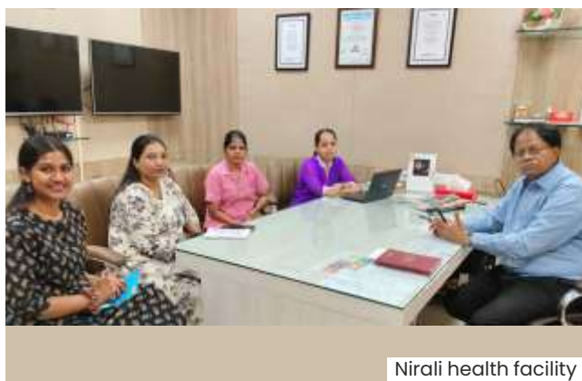
Nirali health facility