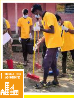
11 SUSTAINABLE CITIES AND COMMUNITIES