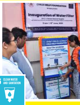
6 CLEAN WATER AND SANITATION