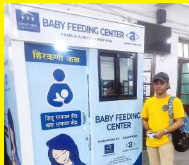
Cama and Albles Hospitals Maharashtra