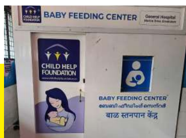
General Hospital Kerala