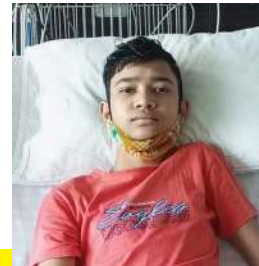
Swagat 13 Years Leukaemia