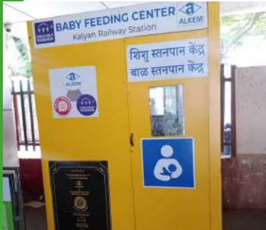
Kalyan Railway Station Maharashtra