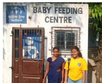
Palghar Railway Station Maharashtra

Child Help Foundation volunteers visited Baby Feeding Centres to get updates on the maintenance of the centres. Centres at Palghar Railway Station (Maharashtra), Boisar Railway Station (Maharashtra), CAMA Hospital (Maharashtra), St. George's Hospital (Maharashtra), Sir JJ Hospital (Maharashtra), Urban Health Centre (Maharashtra), Pune Railway Station (Maharashtra) General Hospital (Kerala), Lakeshore Hospital (Kerala), Chottanikkara Temple (Kerala), Vizag Railway Station (Andhra Pradesh), CV Raman Hospital (Karnataka) and Shri Atal Bihari Vajpayee College (Karnataka) were found to be well-maintained and well-utilized. In Maharashtra's Kalyan and Kurla Railway Stations, the keys to the centres were handed over to the staff to guide the mothers using the centre. Signboards are being prepared for Kashimira Police Station in Maharashtra to indicate the presence of the centre. However, usage of centres at Katihar Railway Station (Bihar) and New Jalpaiguri Railway Station (West Bengal) was found to be average.