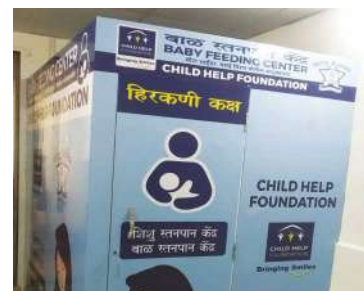
Kashimira Police Station Maharashtra