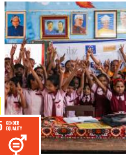
5 GENDER EQUALITY