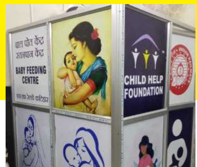
New Jalpaiguri Railway Station West Bengal