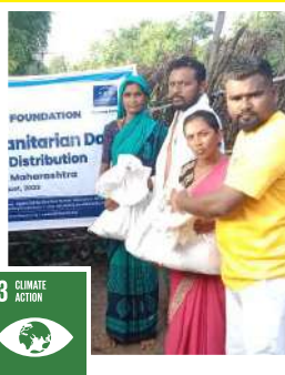
13 CLIMATE ACTION