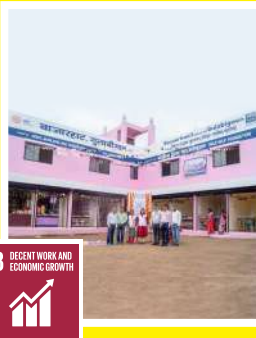
8 DECENT WORK AND ECONOMIC GROWTH