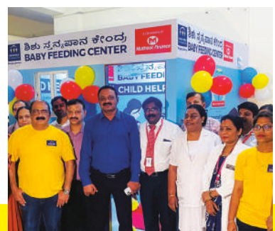
Shri Atal Bihari Vajpayee College Karnataka