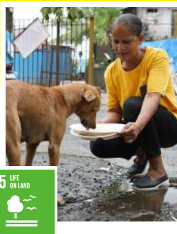
15 LIFE ON LAND