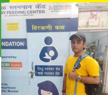
St. George's Hospital Maharashtra