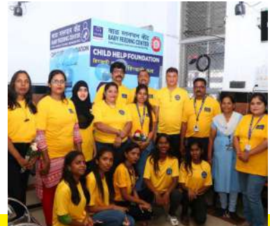
Pune Railway Station Maharashtra