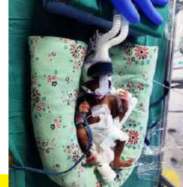
B/O Pushpavathi 5 Days Premature Birth Complications