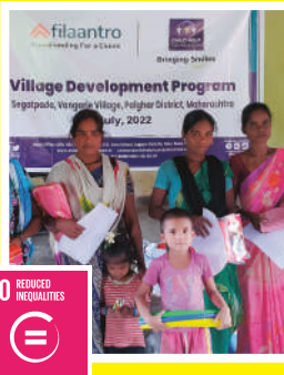
10 REDUCED INEQUALITIES