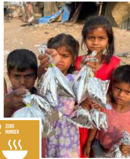
2 ZERO HUNGER