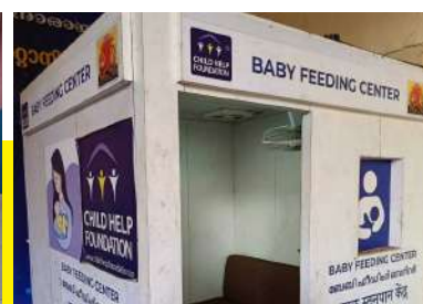
Chottanikkara Temple Kerala