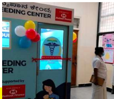
Lady Curzon Hospital, Shri Atal Bihari Vajpayee College Karnataka