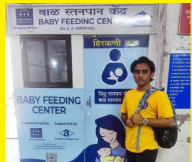
Sir J.J. Hospital Maharashtra