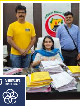
17 PARTNERSHIPS FOR THE GOALS