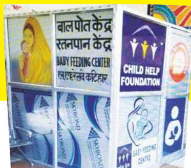
Katihar Railway Station Bihar