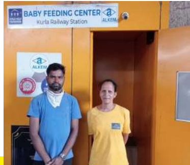
Kurla Railway Station Maharashtra