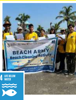
14 LIFE BELOW WATER