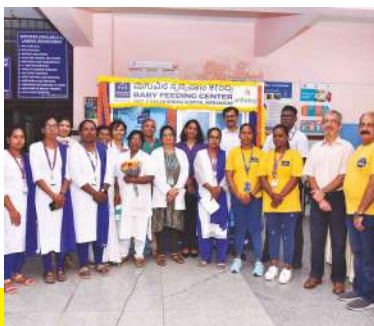
C. V Raman Hospital Karnataka