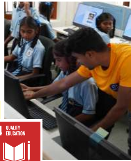
4 QUALITY EDUCATION