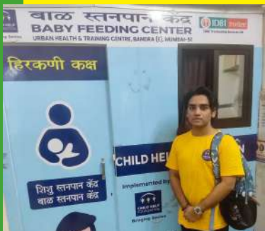
Urban Health Centre Maharashtra