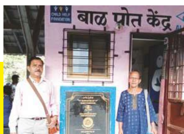
Boisar Railway Station Maharashtra