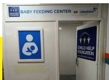
Lakeshore Hospital Kerala