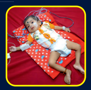
Baby of Mounika (9 months) Spinal Infection