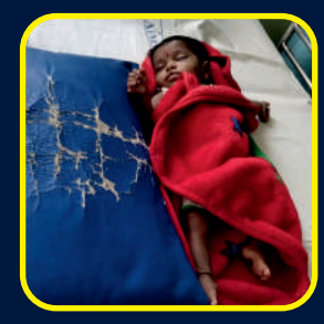
Sonakshi (9 months) Heart Defect