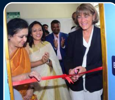
Chennai Tamil Nadu