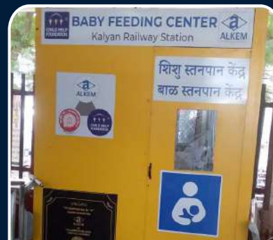
Kalyan Railway Station Maharashtra