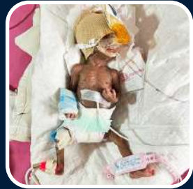
B/o Sneha Sukumaran Infant