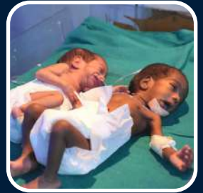
Twins of Pooja 3 Days