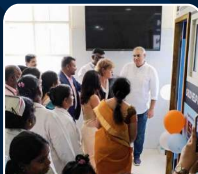
Chennai Tamil Nadu