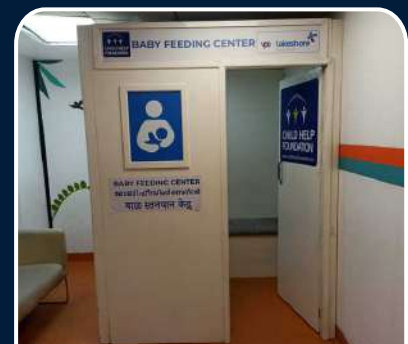
Lakeshore Hospital Kerala