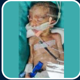
B/o Sandhya Infant