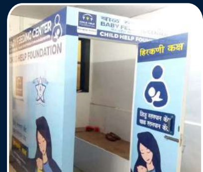
Kashimira Police Station Maharashtra