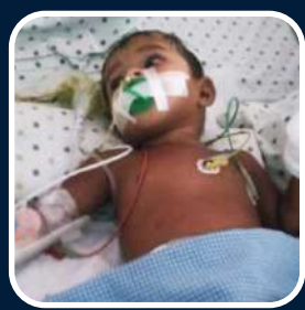
Sumayya 1 Year Hirschsprung Disease