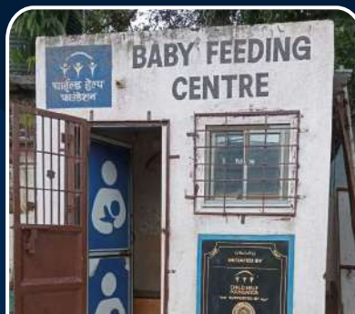
Palghar Railway Station Maharashtra

Other BFCs are also functional. The utilization is good and looked after well by the hospital staff and the railway staff.