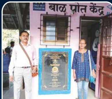
Palghar Railway Station Maharashtra

Child Help Foundation visited Baby Feeding Centres (BFCs) in Pune, Palghar, Boisar, Kalyan, and Kurla Railway Stations and JJ Hospital, Cama Hospital, St. George's Hospital, Urban Health Centre Hospital, Kashimira Police Station in Maharashtra, BFCs in Chottanikkara Temple, General Hospital and Lakeshore Hospital, in Kerala, Atal Bihari Vajpayee and C. V Raman Hospital in Bengaluru, Karnataka, BFCs in Katihar Railway Station, Bihar and New Jalpaiguri Railway Station, West Bengal and Egmore Medical Hospital, Tamil Nadu, throughout the month of October to take updates. All BFCs were found to be well-maintained and hygienic. A brand new BFC was also inaugurated at Vizag Rly Station, Andhra Pradesh on 20th October, 2023.