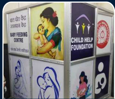
New Jalpaiguri Railway Station West Bengal