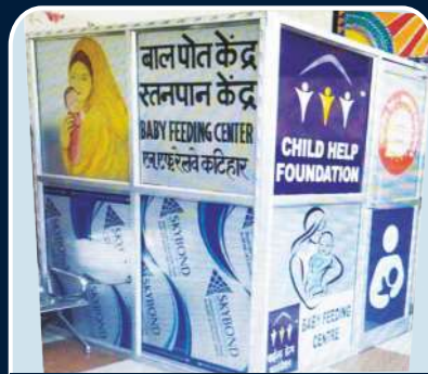
Katihar Railway Station Bihar