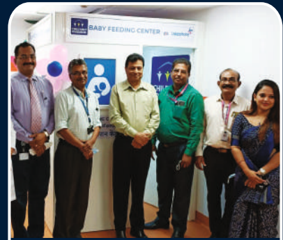
Lakeshore Hospital Kerala