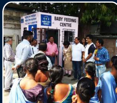
Boisar Railways Station Maharashtra