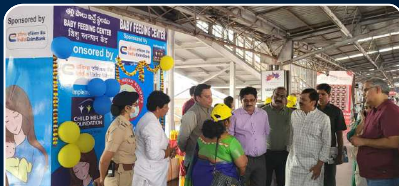
Vizag Rly Station, Andhra Pradesh