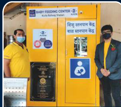
Kurla Railway Station Maharashtra