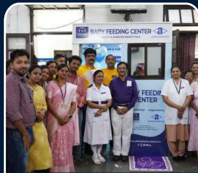
Cama and Alless Hospital Maharashtra