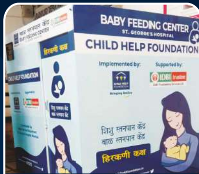
St. George's Hospital Maharashtra