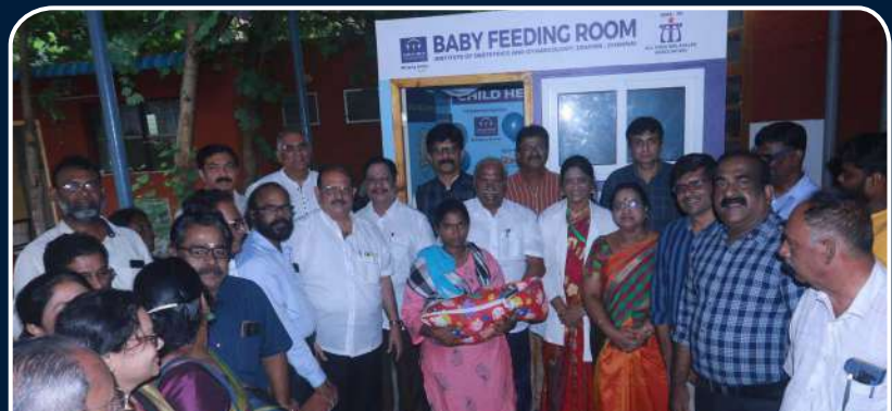
Egmore Medical Hospital, Tamil Nadu