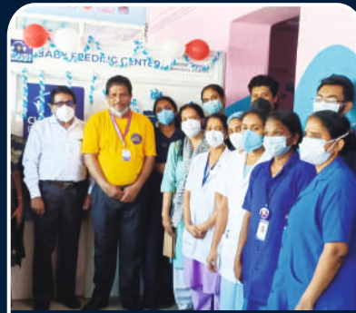
General Hospital Kerala