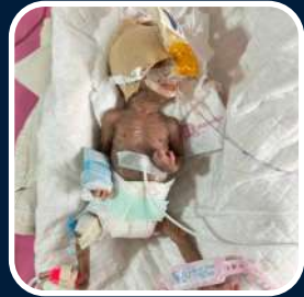
B/o Sneha Sukumaran Infant