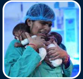
Twins of Pooja 3 Days