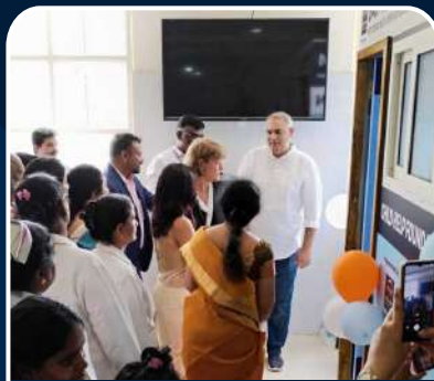
Chennai Tamil Nadu