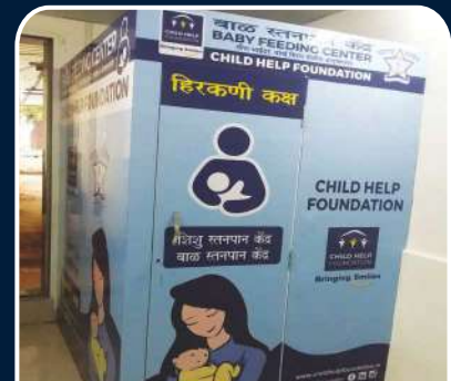
Kashimira Police Station Maharashtra