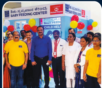
Atal Bihari Vajpayee Karnataka