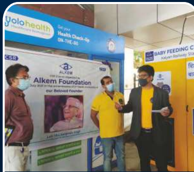
Kalyan Railway Station Maharashtra