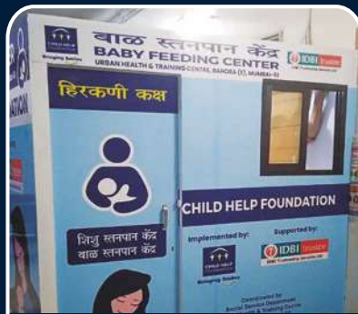
Urban Health Centre Maharashtra