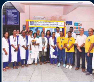
C. V Raman Hospital Karnataka