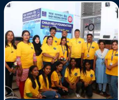
Pune Railways station Maharashtra