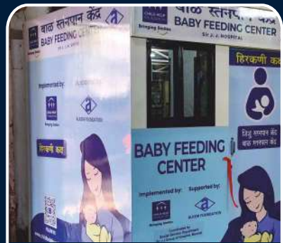
Sir J.J. Hospital Maharashtra