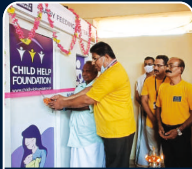
Chottanikkara Temple Kerala