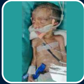
B/o Sandhya Infant