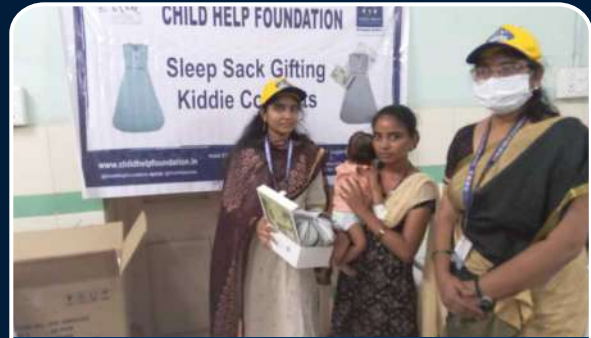
Visakhapatnam, Andhra Pradesh