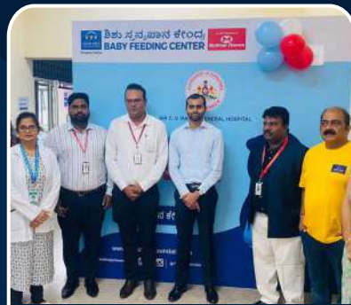
C. V Raman Hospital Karnataka